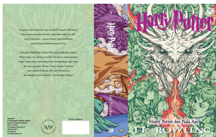
Figure 2 New Illustration for Harry Potter Indonesian Edition