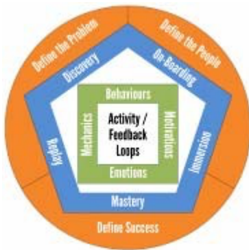
Fig. 2. Gamification framework [10]

This gamification framework was later revised (see Fig. 2). Unlike the previous one, the proposed framework clearly defined the key factors that affect the change in terms of student's behaviors, immersion, emotions and mechanic (psychomotoric). [10].