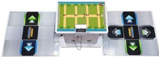
Fig 6. Final Arcade Game Design