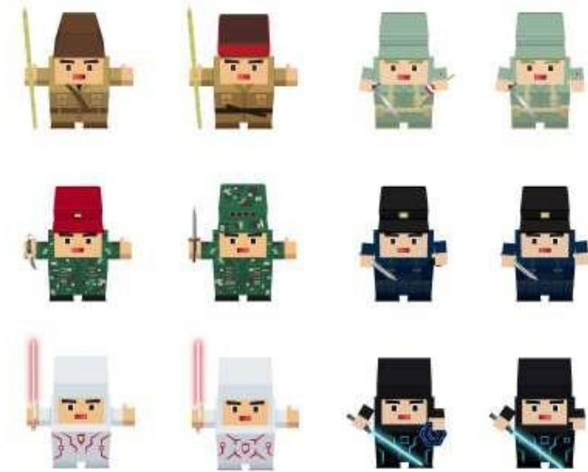
Fig 3. Characters and Weapons Design

The weapons were first also sketched and designed in the pixelated-style illustrations by only using squares to illustrate the original weapon. As the characters were changed and developed into sprite-style illustrations, the weapons were then developed with shapes that have sharp edges. Moreover, the bombs to put in the goal by Player 1 were made for the present and future. The colors of the weapons and characters were adjusted according to be clearly seen on top of the settings background.