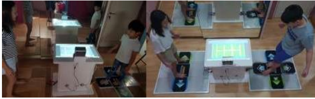
Fig 5. Multiplayer testing

thickness of wires and lack of aluminum foil for the stomp pads. However, they keep playing the game and proven enjoyable.