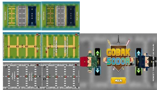
Fig 4. Final Game Screens

The settings design will involve tiles and squares which are used in many popular game designs like Clash Royale and Plants Vs Zombies. The tiles where players of the defense team will be indicated with different tile colors. The researcher explored and compared which color contrast and pattern is best to be used. However, since the game atmosphere and settings should represent the real world, the colors and objects in the game were added according to real life objects in the simplified sprite-style illustrations. Later, more assets were added and modified to top-down view considering each of the player's view.