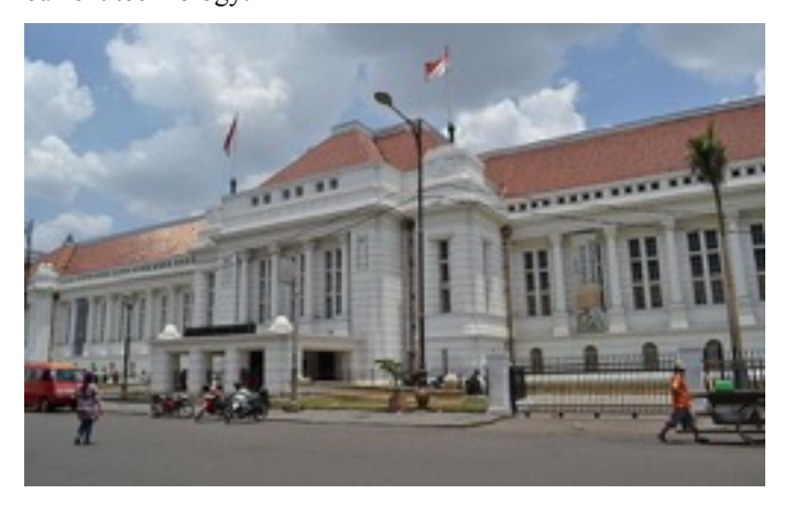
Fig. 1 Museum Bank Indonesia

Indonesia, and Museum Perumusan Naskah Proklamasi. The three museums were chosen based on location, popularity, and historical content that might be relevant to be updated using current technology.