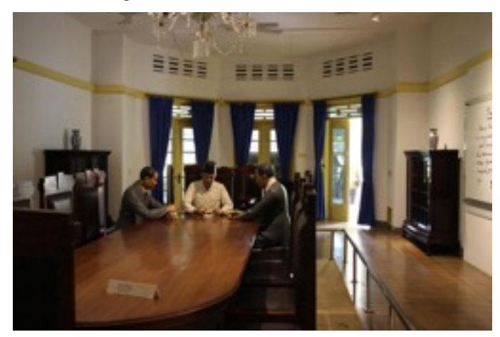
Fig. 4 Museum Perumusan Naskah Proklamasi

Each multimedia device is a complement to the collection, adding additional value for the visitor. The information laid out clear and focused for the selected object / display. Some video displays in a form of new media art and while visually looked good, the audio supported somehow lacking and does not represent the collection depicted in the area. Overall, Museum Bank Indonesia sets a standard in Multimedia aspect to enhance the visitor's experience.