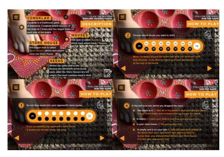
Fig. 13 Menu Interface

Once the UI is finalized, the researcher then implemented the design to the actual device and starts the playtesting to see whether the interface is working as intended