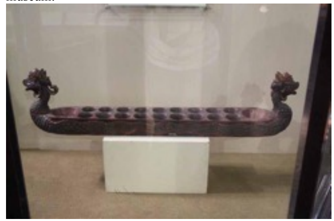
Fig. 9 Congklak in the Museum Nasional

Congklak is one of the objects displayed in the Museum Nasional. Originally from Java, it is an interesting artifact because not only it is still available in the market, but also available in many forms including digital version. Congklak is a popular traditional toy, yet the object lacks information in the museum.