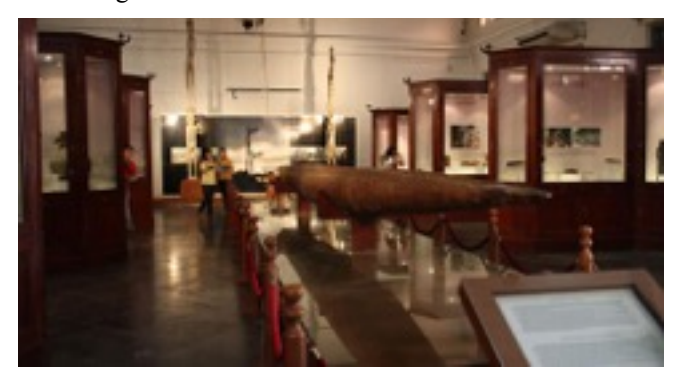
Fig. 8 Ethnography Section

Divided into 6 areas in the old wing, each section packed with various artefacts across the archipelago. The researchers focused on the ethnography collection due to the variety, size and type of object displayed. The Museum provides a static experience with most artefacts having very minimal information. As a traditional museum, the ethnography section is one of most popular area. With artefacts from across Indonesia, this section has a lot to offer and the objects are quite interesting as well.