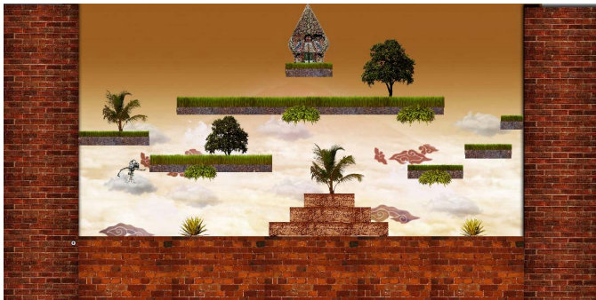
Fig 4. The Game Model

Ghatotkacha trip to meet the god Batara Guru, will be hampered and hindered by the spirits and animals. Users will use a strategy of his own choice and Ghatotkacha going all out to use his strength to fight it all.