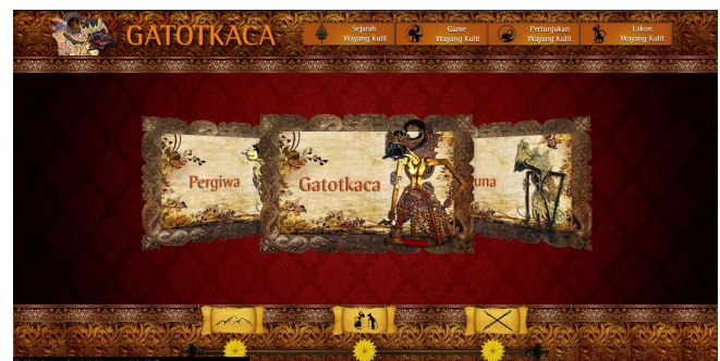
Fig 2. Main Menu

Visual design of Ghatotkacha game is still rely on the traditional elements like there are two kinds of clouds; mega cloudy and regular clouds. Here combined two clouds as a backdrop. Awan used to say as by Ghatotkacha walk somewhere or road at a certain height. Also placed a mountain that looked vaguely as part of the natural beauty alone. Altitude, clouds and mountains have a strong enough