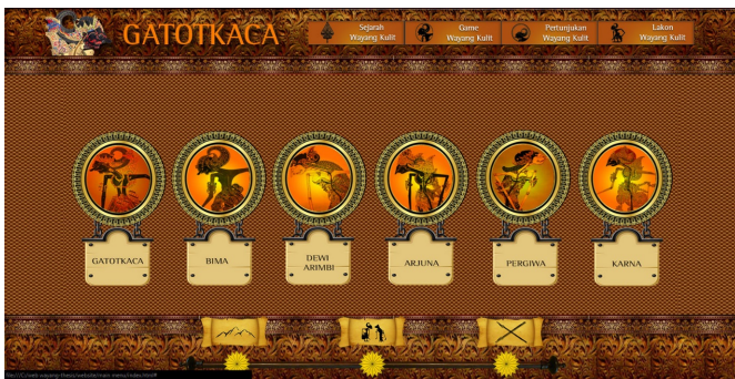
Fig 3. Game Figure

Concept 2 dimension to the game as well to maintain the originality views of wayang kulit even placed on digital media. Coupled models that adopt the platformer genre game from one of the best-selling game of all time, namely Mario Bros. Mario character has appeared 200 game titles and has sold 193 million copies worldwide. This is the background writer puppet design games with the genre. Ghatotkacha displayed with Mario Bros style famous in the world.