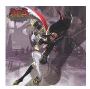
Image. 3."Ghatotkacha" character design in Boma Naraka Sura PC game.

other design form, that there are none in R.A. Kosasih artwork, are clearly drawn in Oerip and Yuniarso version, and the Caravan Studio version of Gatotkaca, they are deformed into pointy shape in character shoulders attributes. Gatotkaca in wayang has malang kerik gesture; dashing strong movement that always ready to fly.