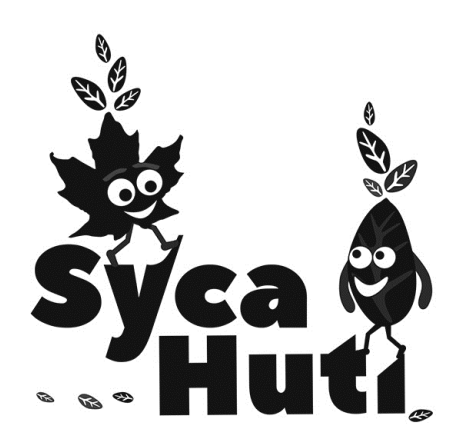
Fig 3. Name and identity of character design