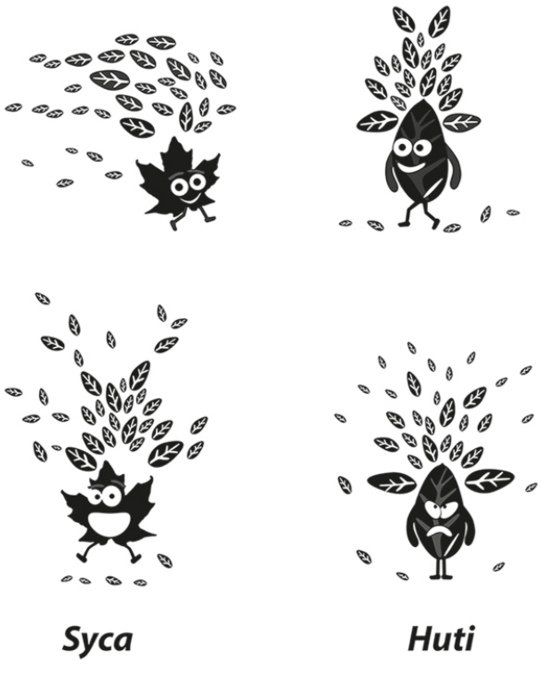
Fig 2. Character final expression