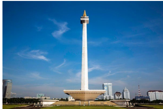
Figure 4. Jakarta – Enjoy Jakarta (2004)