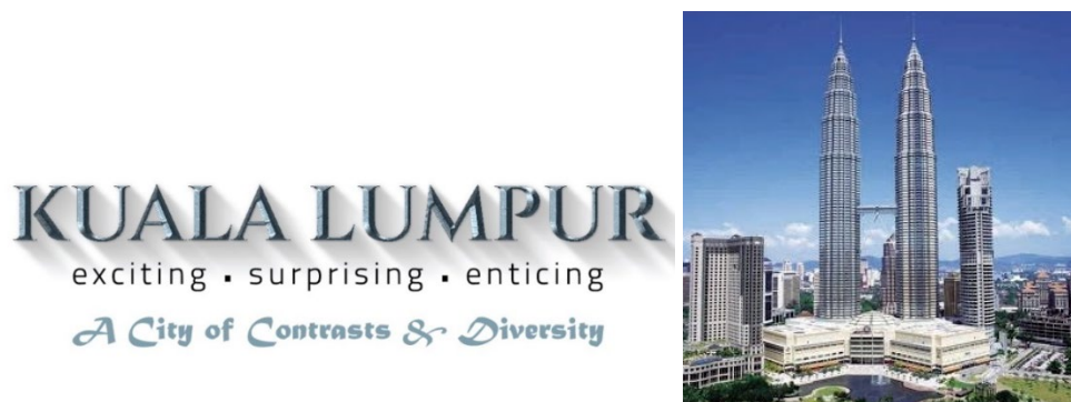
Figure 3. Kuala Lumpur – A City of Contrast and Diversity (2016)