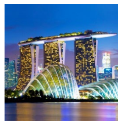
Figure 2. Singapore – Passion Made Possible (2017)