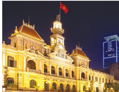
Figure 5. Vibrant Ho Chi Minh City (2011)