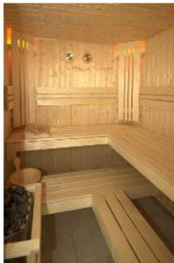
Figure 1. Sauna room interior.

Then the medical discovery that the virus would die if exposed to a fairly high temperature for a certain period of time became the focus of research to be carried out by developing a hot room with steam to neutralize the body's surface from the Covid-19 virus. This room can be an alternative to the disinfectant booth, but it will be refocused on a health center which is full of activities for handling patients exposed to the virus and isolated patients. The design of this room is inspired by the sauna room which is located in beauty and relaxation centers, even basic things such as the design are in accordance with the concept and purpose of making the object of research, in terms of material using fibrous wood and absorbing heat, firm shape, natural color, heater. the room uses infrared, which differs only from a technical point of view of seating because there are health procedures applied.