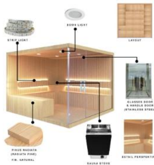
Figure 4. Perspective simulation design.

The following is a design simulation based on data and various considerations that have met the design criteria in accordance with the recommendations of the applicable health protocol standards.