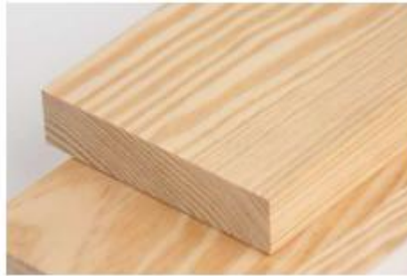
Figure 2. Radiata pine wood.

Application to the room: wood is used for all interior elements from the floor, ceiling and walls. Then the use of this wood is also used for the stove and the seat.