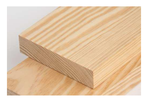
Figure 2. Radiata pine wood.