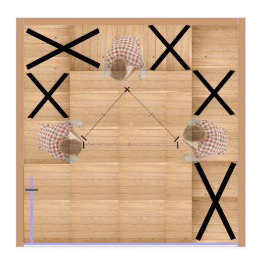
Figure 5. Layout seating simulation.