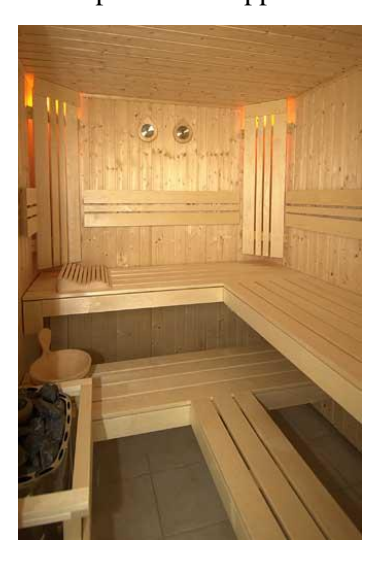
Figure 1. Sauna room interior.

Then the medical discovery that the virus would die if exposed to a fairly high temperature for a certain period of time became the focus of research to be carried out by developing a hot room with steam to neutralize the body's surface from the Covid-19 virus. This room can be an alternative to the disinfectant booth, but it will be refocused on a health center which is full of activities for handling patients exposed to the virus and isolated patients. The design of this room is inspired by the sauna room which is located in beauty and relaxation centers, even basic things such as the design are in accordance with the concept and purpose of making the object of research, in terms of material using fibrous wood and absorbing heat, firm shape, natural color, heater, the room uses infrared, which differs only from a technical point of view of seating because there are health procedures applied.