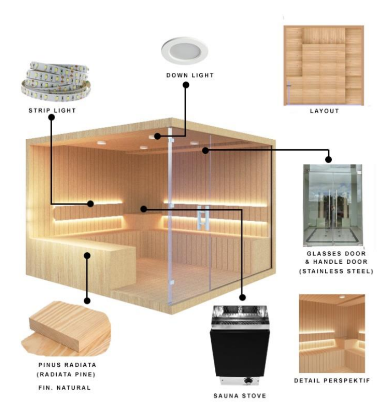
Figure 4. Perspective simulation design.