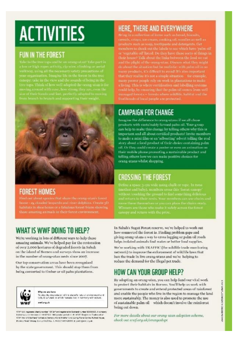
Figure 4. The fourth page of Orang Utan Poster (www.wwf.org.uk)