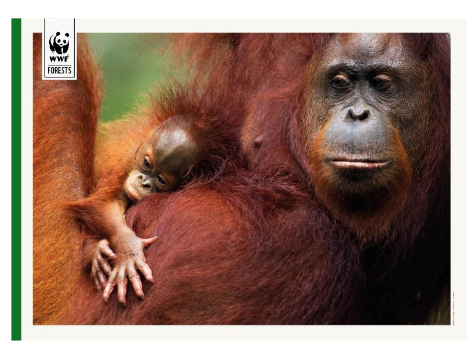
Figure 1. The first page of Orang Utan Poster

This poster is landscaped with a ratio of 4:3. In the poster there is the main focus is the illustration of a photo of the mother of Orangutan who is holding a Orang Utan child. The size of the illustration dominates the layout. The illustration is framed box on the outside of the illustration and there is a green line on the left of the layout. At the top of the left is the WWF logo.