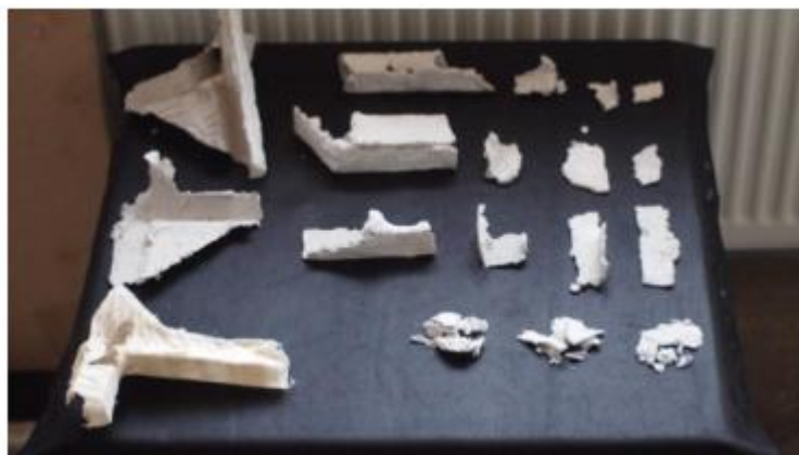
Figure 2. Casting the formal properties of the stairs as object.

As an example, the student attempted to do both physical and poetic approaches in this phase. Figure 2 and Figure 3 illustrate the physical exploration of stairs as a selected archetype element of an interior. It focused on the opportunity to understand in-depth through casting the object into parts and components. During the early phase of exploration, the student applied the technique of material casting by using plaster (Figure 2) and plastic tape (Figure 3) as a tool. In this conceptual phase, the student attempted to analyze the physical shape of the stairs and tried to discover how the stairs have a dialogue with the user's body as an initial design idea.