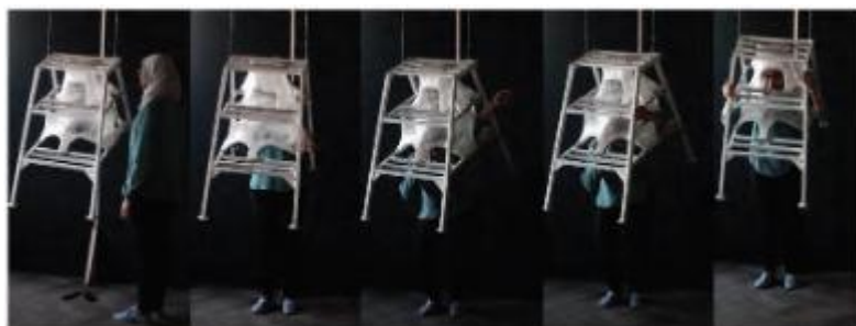
Figure 5. Stairs as body prosthesis.

On the other hand, the concentration on the physical matter discipline combined with conceptual speculation included sense and imagination, which refers to poetic analysis. Figure 4 shows the student assumption of the idea of stairs as body supporting tools. The student conducted a series of locomotion in exploring the physical form of the stairs. After deciding the specific approach, the student developed a personal method to capture it into materials. The particular techniques and types of material will be thoroughly investigated, embracing the analytical and conceptual input. The student also included her intuition of will as an individual practice of experimentation and the conceptual consequence of a chosen material and technique. This series of processes exploring formal properties and material experimentations will expand toward designing spatial installation on a 1:1 scale (figure 4). In this project, the stairs as an archetypal element of the interior become a spatial installation with the idea "Stairs as Body Prosthesis" presented in the exhibition place in Rotterdam. This project investigates the newly spatial context as a public installation or commodity where the stairs will settle. This spatial installation shows the process of exploring the stairs' alternative future life by conducting archaeology of interior architecture as a design approach.