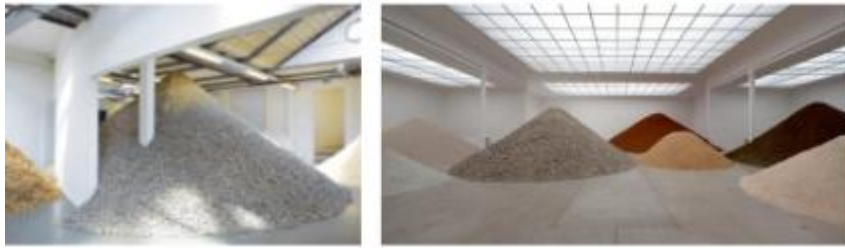
Figure 1. Spanish pavilion at the Venice Art Biennale 2013.

The position of archaeological study in the interior architecture discipline examines the discovering and observing process of the unknown exploration subject. The subject can be anything from isolated artefact to the broader existing site (Minale, 2014). Although the records and the documentation about the site's origin are available, the condition would lose the primary purpose for the present context. Therefore, it is necessary to correlate the systematic excavation and well-recorded object information to make the present context more coherent and meaningful in the spatial design process.