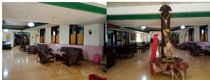
Figure 1. Hotel Splendid Inn's Lobby

According to the hotel owner, the entire area of the hotel is 1700m 2 . However, from direct observation, the hotel lobby measures approximately 279m 2 which includes the reception and dining room. The room area has an area of 36.5m 2 which includes an en suite bathroom.