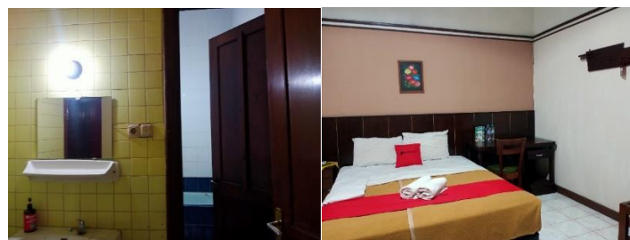
Figure 2. Hotel Splendid Inn's Room and Bathroom