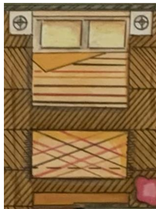
Figure 2. Element interior.

The room is a partition made of bamboo which has been transformed from a typical Osing angklung paglak , then there is a carpet with an Osing woven pattern combined with retro colors, on the bed there are also decorative elements starting from the headbed, curtains and bedposts, as well as cottage door motifs made from a combination of osing and vintage. Place decorative elements in the cottage so that visitors can see the typical Osing culture which has been processed into several interesting decorative elements.