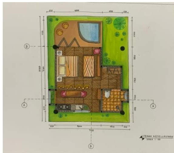
Figure 1. Location.

Layout is the arrangement of furniture that forms the scope of the plan that is visible from the section on buildings in a room, and made according to the existing concept determined.