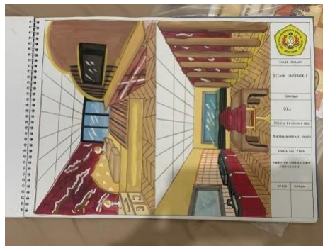
Figure 3. Perspective kitchen area and bedroom area.

The design on the OSG's healing cottage ceiling, like ceilings in general, is made of wood. Transform the design of the ceiling by applying various types and types of lights so that the room looks brighter and can give the impression of a comfortable atmosphere.