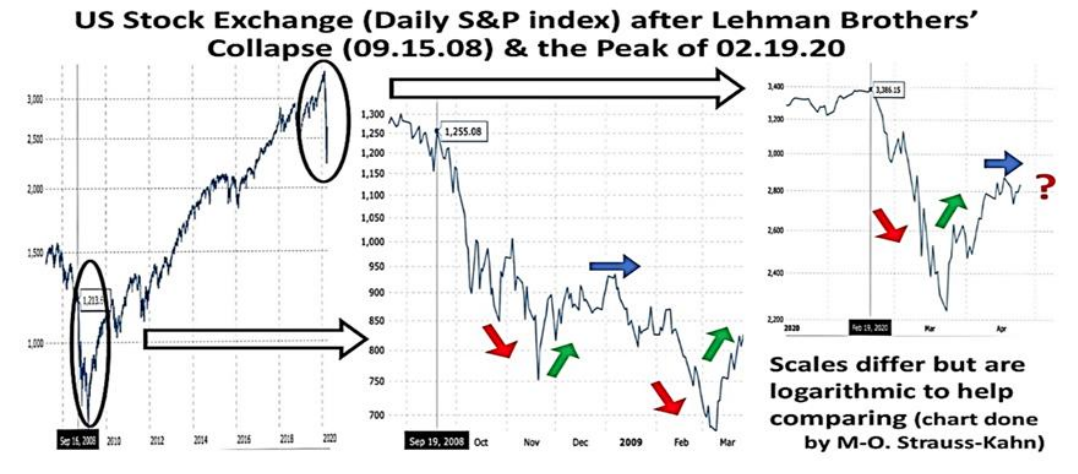
Figure 1. S&P Daily Index for GFC (September 15, 2008) and COVID-19 (February 19, 2020).

Note. Adapted from Can we compare the COVID-19 and 2008 crises?, by Strauss-Kahn, M-O. 2020, May 5, Atlantic Council (https://atlanticcouncil.org/blogs/new-atlanticist/can-we-compare-the-COVID-19-and-2008-crises/). Copyright Atlantic Council.