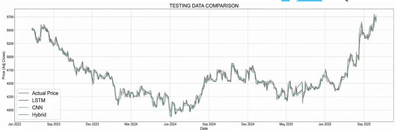
Figure 3. Comparison between the actual stock prices and the predicted values generated by the CNN, LSTM, and hybrid CNN-LSTM models on the testing dataset

A visual comparison between the observed stock prices and the predicted values generated by the three models is presented in Figure 3.