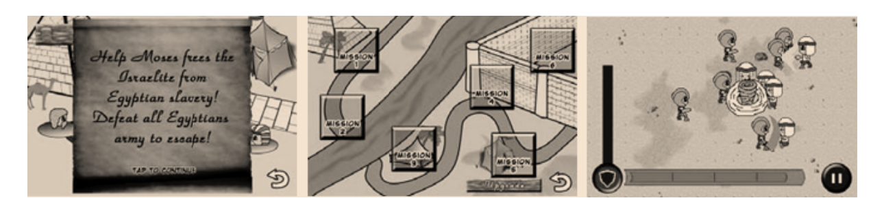
Figure 3 Moses Game

other characters such as Mpu Gandring, Kebo Ijo, Tunggul Ametung, Anusapati and Penghuni Hutan. The comprehensive details of the game can be read at (Chowanda & Prasetio, 2012).