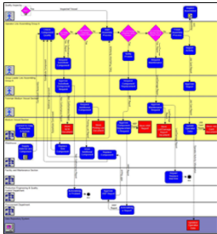
Fig. 2: Workflow of Generic Assembling Process in Medium Vessel Section [7]

included, since MES is part of ERP. The included Open-Source MES Applications are OpenBravo™, ADempiere™ and xTuple™.