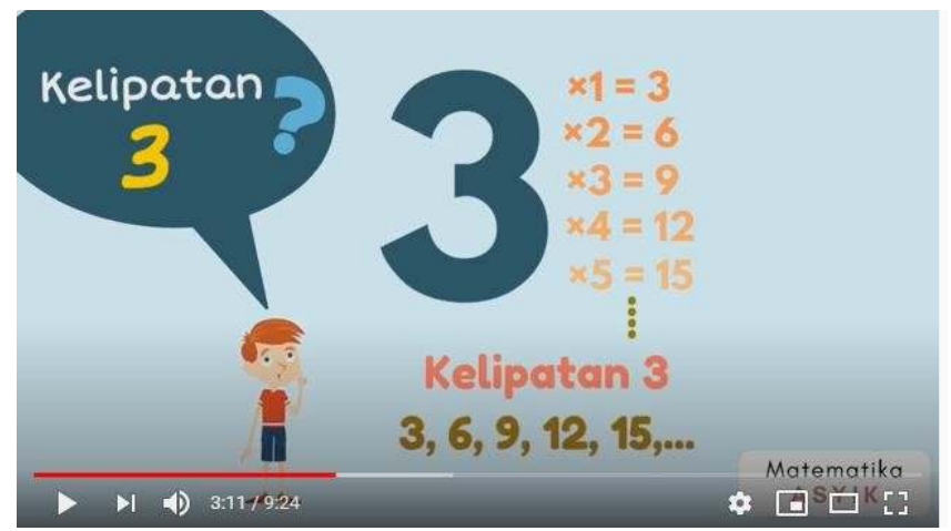
Figure 1 Material Multiples of numbers