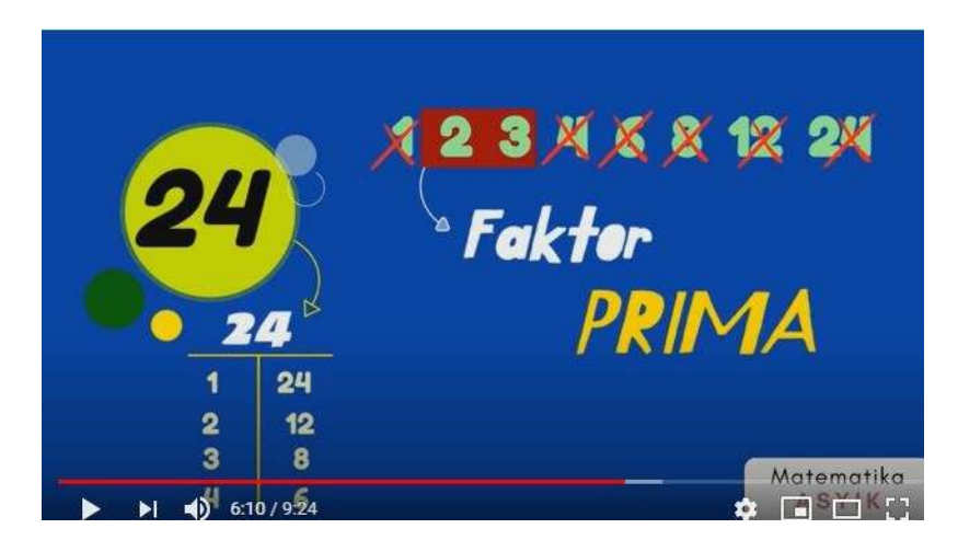
Figure 2 Prime factors