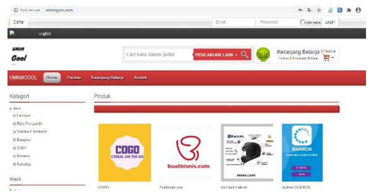
Figure 2. Confidence Karang Taruna Not successful Registration on the umkmgool website