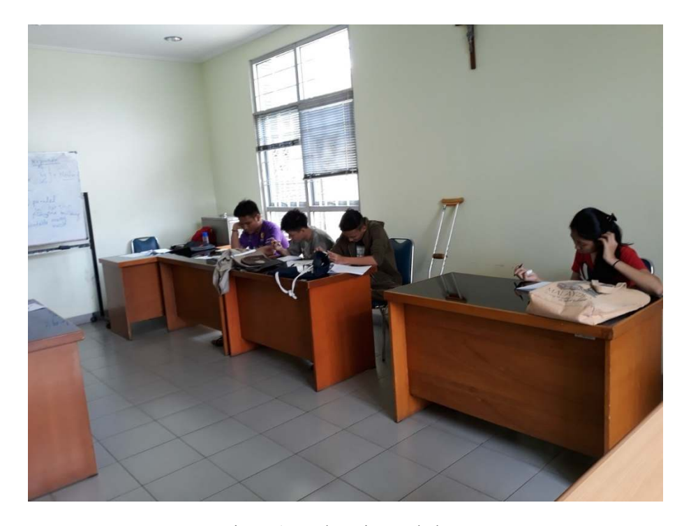
Figure 1. Students in Read phase