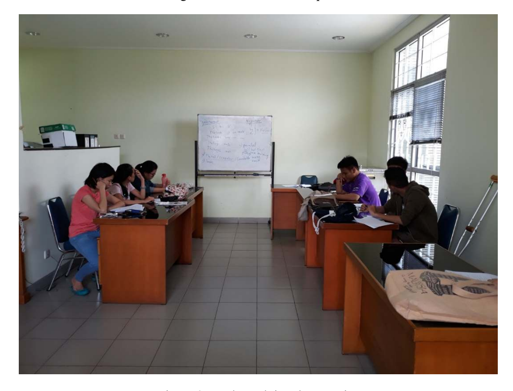
Figure 2. Students doing the exercise