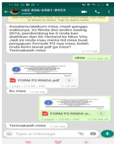
Figure 3 The Use of Miss

result can be guessed easily that habit, tradition, and culture are assimilated in the use of the language. It happens when addressing terms such as Miss, Mam, Sir, and Mister. Although Indonesian can understand the use of the addressing term in English, somehow, their cultural and contextual background does not allow the usage.