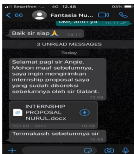
Figure 2 The Use of Sir

Sociocultural influences the way of thinking, as highlighted by the Sapir-Whorf concept. It is expected that when someone speaks a certain language, he/she likely follows the mindset that the people or society bring into the language. Certain Indonesian people can speak and behave just like natives when they speak English, while others can still speak English with an Indonesian mindset. Cultural transmission becomes significant in supporting the idea. Yule (in Zavitri, 2018) acknowledges that people have learned a certain language and a systemic order and add their own experience. The own experience mentioned in the statement is a cultural background itself. Indonesian tends to match the English addressing term with the existing words in Indonesian that are equal. The research proves that the Indonesian language influences the use of English in terms of addressing based on cultural background. Another research found that English has become the second language and the language of instruction (Alrajafi, 2021). Most data show that university students would likely use English terms of addressing by adjusting them to Indonesian. The data vary from universities all over Indonesia. The phenomenon indicates fossilization.