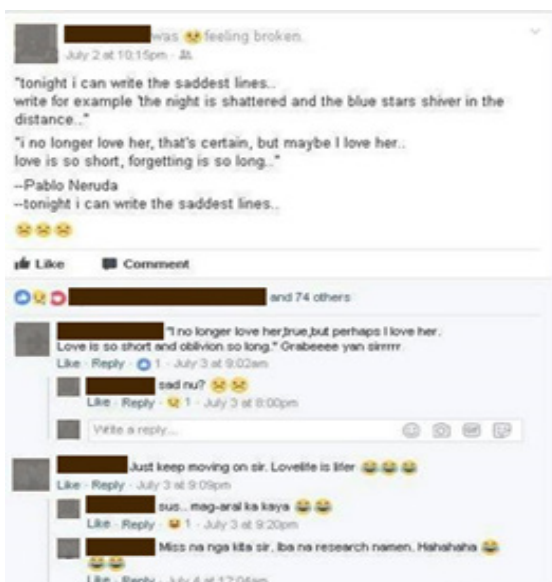
Figure 4 Theme of Interest in a Teacher's Post