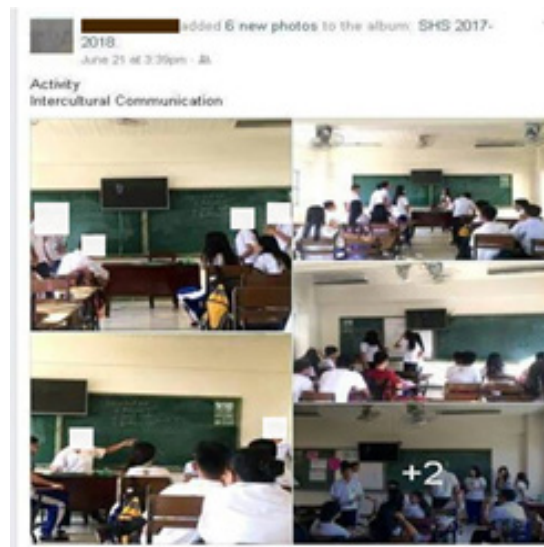
Figure 9 A Teacher's Post Showing Student Activity

that are actually put justified since the motives appear to be more of maintaining or strengthening student-teacher rapport by use of humor and not of stressing the academic value of the task.