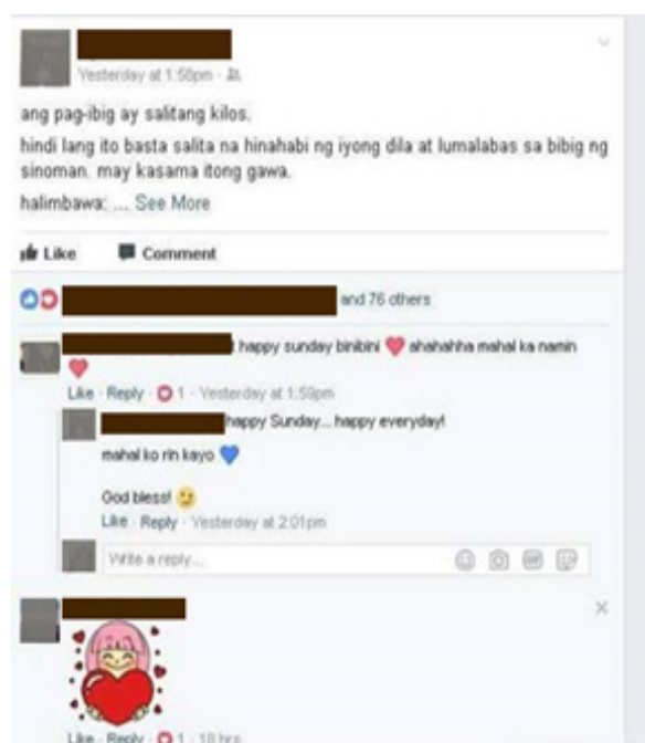
Figure 1 Theme of Appreciation and Gratitude in a Teacher's Post

(2007) in which student-teacher relationship is maintained online.