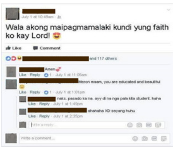
Figure 5 Theme of Status in a Teacher's Post