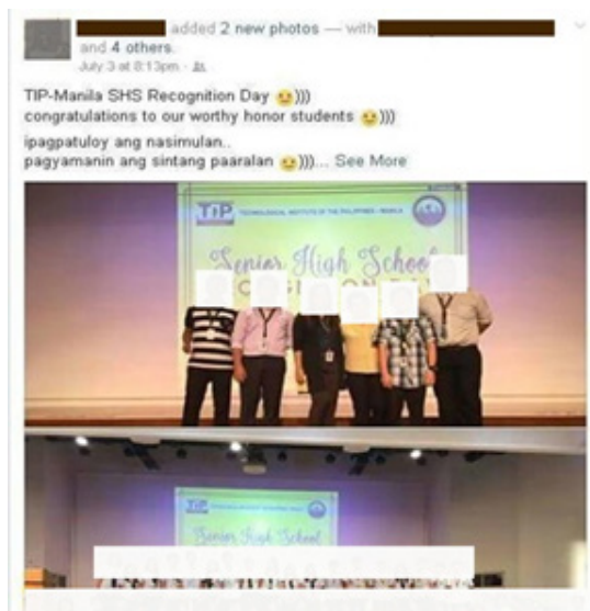
Figure 8 A Teacher's Post Utilized for School Announcement

Facebook is utilized as a tool for extending not only the boundaries of traditional journalism but also of traditional communication avenue between students and teachers. Facebook has served the purpose of a bulletin board that can be accessed or viewed at a distance without thinking about geography and time as barriers.