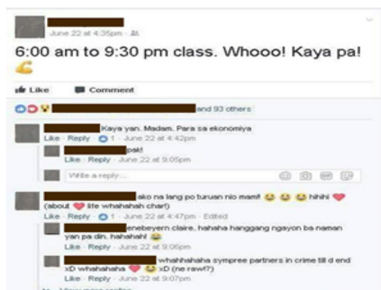
Figure 6 Theme of Status in a Teacher's Post

The second research objective is to ascertain whether teachers can initiate academic/instructional purposes through the use of Facebook. To provide clarity on this,