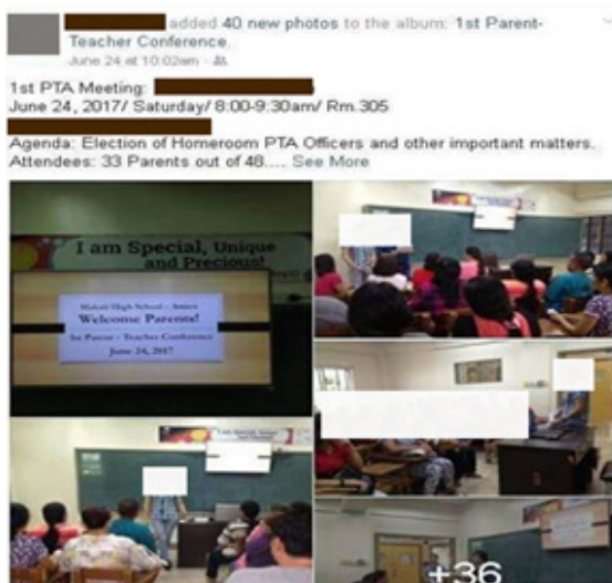
Figure 7 Teacher's Post Utilized for School Announcement