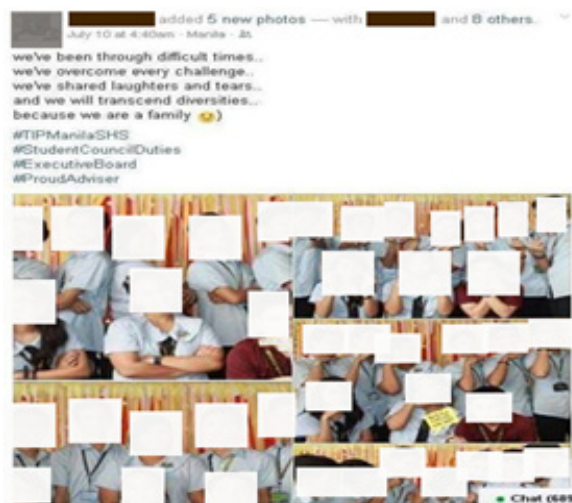
Figure 10 A Teacher's Post Depicting Extra-curricular Activity

There is a teacher who posts pictures of extra-curricular activities to show that he is a proud adviser of two school organizations, the student council and the art club. It can be seen in Figure 10.