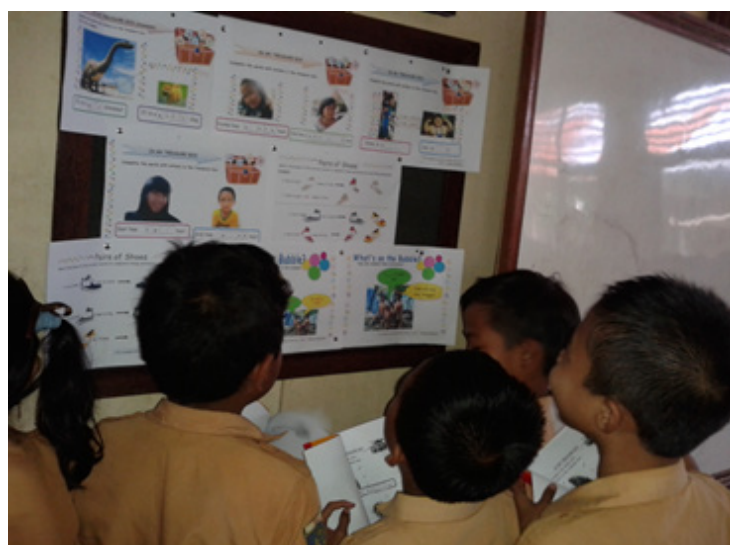
Figure 1 Students' Enthusiasm in Doing Independent Learning

Based on the observations on the implementation of RLLE model in the schools, the students demonstrate enthusiasm to learn independently. They huddle in front of a display board before the lesson is begun at the recessed time and before returning home. It is observable that all students are actively and voluntarily involved in independent learning either by silent reading or working on their journals as seen in the Figure 1.