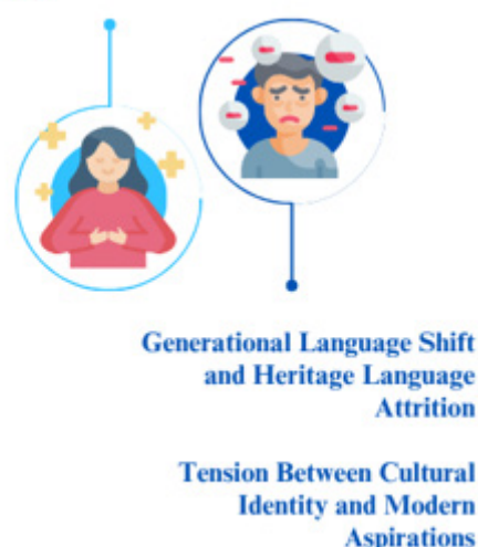
Figure 2 Themes on Indigenous Youth's Preference for English

Code-Switching and Translanguaging as Survival Strategies