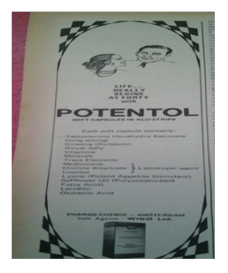
Figure 1 Advertisement of Medicine for Adult Men's Stamina Suggesting Masculinity

Quoting Shahab (2006), the strength and ingenuity of men in sexual intercourse becomes a myth of men who lived in the 1970s. He added that there were a lot of advertisements offering promises in which men can increase their strength in a sexual intercourse. The promises were directed not only to the men of the lower or working class but also to the men of both the middle and the upper middle class. It can be seen from Picture 1, which is the advertisement placed in Tempo magazine of August 14, 1971 edition. This magazine is considered as a representative magazine for both the middle and the upper middle class.