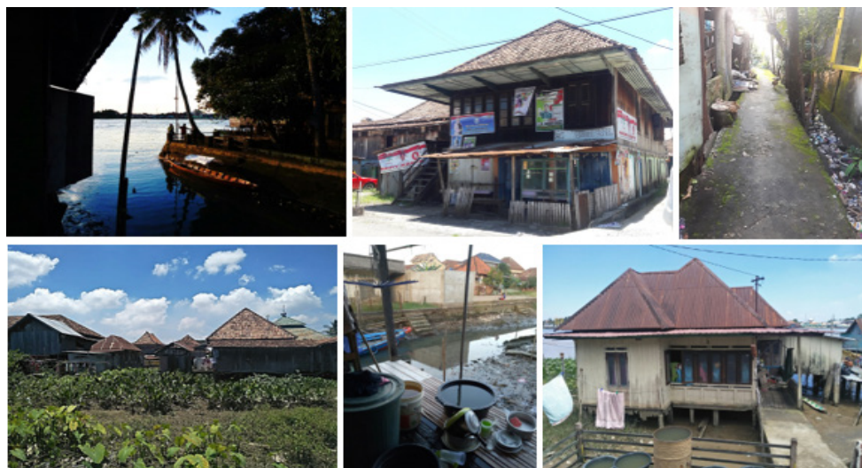
Figure 3 Physical Condition of Settlements and Houses on The Banks of The Musi River

Table 5 shows the current garbage processing. The amount of garbage in residential areas, especially in rivers, is a major concern for residents. Other aspects that become objections to comfort include the lack of open fields, smelly residential neighborhoods, and narrow neighborhood roads. Unlike residents in other settlements, flooded land is not an objection from residents. Garbage is a problem for environmental comfort caused by the pattern of waste disposal. Most residents dispose of their waste, not in the designated garbage dumps. Less than a quarter of the population throws their waste directly into the landfill, and cleaning staff only served a small percentage of the settlement area. For owners of the land that is not flooded, they can burn their garbage in the yard. Most of the waste comes from disposal by the residents themselves. Residents throw it in the yard of the house,