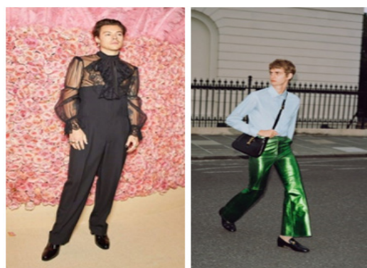
Figure 2 (a) Harry Styles Wears Gucci's Design in Met Gala 2019, (b) Gucci Mx 2020 Collection

The semiotic approach is used in dissecting the meaning of co-ed and androgynous trends in men's fashion and clothing. Figure 2 presents Alessandro Michele's menswear designs for the Gucci brand from the 2019 - 2020 collections.