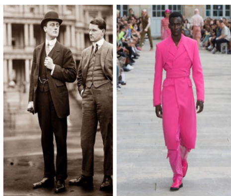
Figure 1 (a) Men's Fashion Style in 1913; (b) Gmbh Spring Collection 2020

In the postmodern era, there is a practical effort to prioritize 'tickling' aspects of expression, such as comedy, parody, puns, or irony of meaning, all trying to play free games in giving aesthetic signs. Postmodern aesthetics generally involve idioms such as pastiche , parody , kitsch , camp , and schizophrenia . The current co-ed androgynous trend in men's fashion cannot be separated from using these idioms to realize aesthetic values in a men's fashion design. Figure 1 shows the comparison of men's fashion styles in 1913 and 2020.