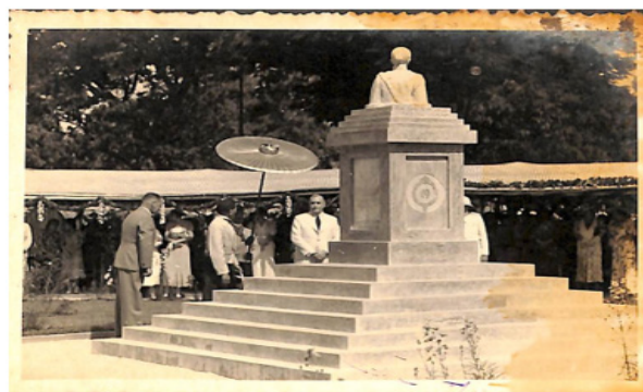
Figure 3 Dutch Resident and Mangkunegara VII Make Offerings at the Statue of Mangkunegara IV at Cembengan Rituals in 1937

The statue of Mangkunegara IV was built in the Mangkunegara VII era as a tribute for the ancestors who had prepared the industrial space of sugar, which was first owned by natives (Figure 3). For the Javanese, the statue is not just a monument depicting their local leader but also a symbol of the sacredness that emerges after establishing the Colomadu sugar factory. The form of homage to the statue Mangkunegara IV in the Cembengan ceremony then passes on generation to the next generation as a dynamic form of cultural memory. Memory is not an unchanging legacy but a resource for making shared stories about the past (Rigney, 2018). Dutch Colonial involves in Cembengan tradition and participates in the following stages of the cultural traditions, including the tribute to the statue, which is believed by the Javanese community as a sanctity.