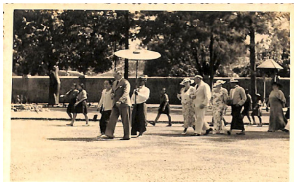
Figure 2 Resident of Surakarta and Administrators of the Colomadu Sugar Factory were Welcomed by Mangkunegara VII and His Wife before The Cembengan Ceremony

were complicated, long, and boring for a western culture that was carried out by the Dutch-Indies officials in the Surakarta residency to become part of the capital of local royal power in Java.