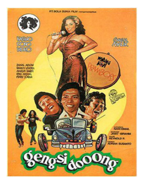
Figure 2 Gengsi Dong Film Poster

Figure 2 shows the film poster of Gengsi Dong, the 1980 Warkop DKI film. It is the third highest-grossing film of 1980 in Jakarta with 230.555 admissions according to Perfin (National Film Distributors Association - filmindonesia.or.id). The denotation of this film poster is Camelia Malik (singer) as the main attraction, who is beautiful and sexy. She is shown smiling dominantly, wearing a dress with a slit up to her upper thigh while holding the mic with her left hand at her waist. On the other hand, the men emerge under the woman driving an old car. At the same time, the connotation of it is the woman that is showed as the main attraction. She seems inviting, alluring, and enchanting to those who see it. The men smile and seem happy. The myth of this poster is the pleasure under the rules of patriarchy, where women are only used as a second man in all respects, including in the context of sexuality. In the patriarchal pleasure method, women are only made objects by men. Women are only used as 'cherry on tops' to attract potential viewers and raise ratings.