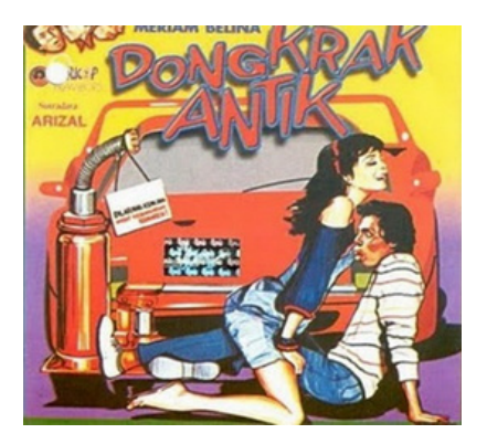
Figure 3 Dongkrak Antik Film Poster

him to jack a car in a fully erotic pose. His left leg is raised in the position of a jack stalk. The connotation is an attraction. The pose of a woman leads to sexuality, lust, makes people curious, eager to see, and even tends to do. If the man and woman position is connected to the film title, it means that this position of lifting the car using the jack. The myth is a real sexual symbol that plays with the beholder's desires, and promises will show even though they are generally outside the discourse of sexuality. Patriarchal culture plays a role and is very influential. Patriarchy is also closely related to the power of women's bodies. Patriarchal culture is believed to contribute to the work that is degrading women, in this case, the headline or title of the movie posters and portraits of a sexy woman who approaches porn action. The fundamental relationship between the dualistic world view and women's objectification has become a central tenet in feminist theory over 30 years