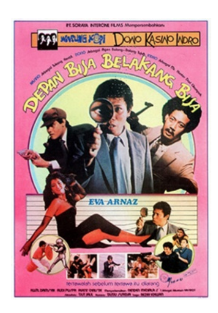
Figure 5 Depan Bisa Belakang Bisa Film Poster

The next film poster is Depan Bisa Belakang Bisa, a 1987 Warkop DKI film that can be seen in Figure 5. According to Perfin data, it is the second most popular film in Jakarta in 1987, with 327.039 viewers (filmindonesia.or.id). This film poster's denotation is a beautiful woman sitting with her legs stretched out wearing a party dress with a slit down to her upper thigh, and her left-hand brushes her hair with a smiling face. The connotation is interpreted as alluring, seducing, inviting, passionate, lust, and erotic. While the myth is in a capitalist industrial society, pornography is packaged in such a way and is mass-marketed; of course, the goal is to achieve maximum profit. Women in the industry are placed as a commodity that is exploited. This is an emphatic depiction of female sexuality through images.