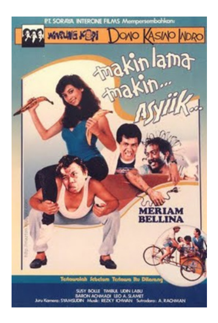
Figure 6 Makin Lama Makin Asyik

and become public consumption in their daily lives, so he is not aware of it. Women are usually proud when they are well known through electronic and printed mass media that makes them unaware that this is a form of obedience to the body through the media with the basic scandal of power in every woman's body that contains pornographic elements. Even though women are in the public sphere, there is still an extension or participation of men's power. The mass media can be used to convey certain messages, as well as related to issues of pornography and freedom of expression. The name of the mass media is also a reflection of the opinion of some people. So that what is published in the media, in this case, the film poster, is what is believed by the public regardless of what is happening behind it. The involvement of patriarchal culture is not only in the private sphere but has also entered the public sphere.