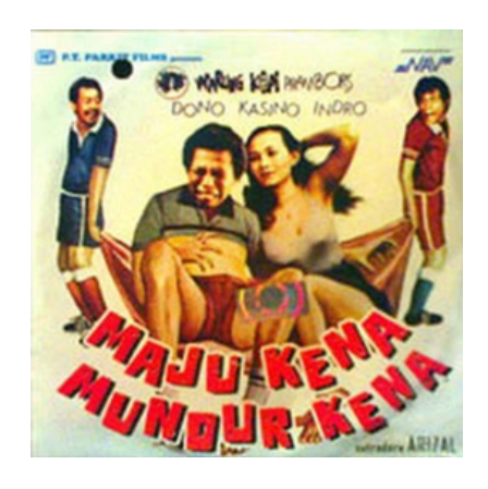
Figure 4 Maju Kena Mundur Kena Film Poster

Figure 4 shows Maju Kena Mundur Kena poster film. It is a 1983 Warkop DKI film. The denotation is a beautiful and sexy woman that wears an undershirt until the part of her breasts posing while parting her hair with her left hand and sitting showing her thighs. Dono also shows his thigh. The connotation is an attraction, an offer, a solicitation, a spoiled, passionate, and erotic attitude. The myth of it is the women's bodies deserve to be obeyed so that it is not to exceed the limits of male authority. The woman seems to