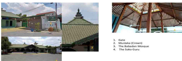
Figure 6 The Babadan Mosque

This mosque (Figure 6) is located in Babadan, Bantul, and was built in 1774. The architecture of the building is the same as that of other state Pathok mosques. It has a soko guru and a pool for washing feet and washing. The unique thing about this building is that there is a particular building for women.