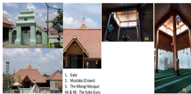
Figure 3 The Mlangi Mosque (Private Documentation, 2019)

There are four Pathok Negoro's mosques in Yogyakarta. They are Mlangi mosque that is located seven kilometers southwest of Kraton, Ploso Kuning mosque is located nine kilometers north of Kraton, Dongkelan mosque is located three kilometers south of Kraton, and Babadan is located five kilometers east of Kraton. The Mlangi mosque (Figure 3) is found by Kyai Nur Iman, a brother of Sri Sultan Hamengkubuwono I. It is standing in the Mlangi area around 1758. At first, this mosque has 16 main pillars and is made of teak wood and has four pillars inside. Another feature characteristic of the Pathok Negoro's mosques is mustaka , which has the same shape as other State Pathok Mosques. Servants of the Palace inhabit the Mosque area, i.e., people who serve the King, so this is a sign that the mosque is Kagem Dalem owned by the Palace. Around this time, there are many pesantren , an Islamic boarding school for Islam's development.