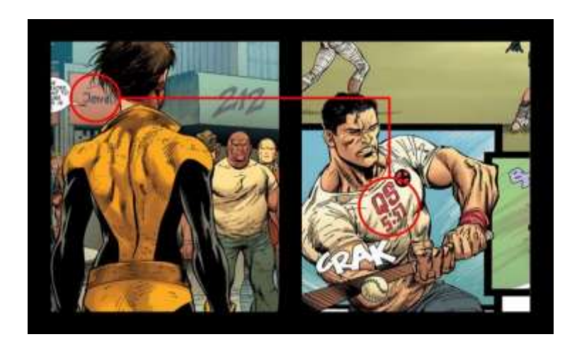
Figure 4 Subliminal Messages of Kitty Pryde and Colossus

Russian who could transform his entire body into "organic steel", increasing his size, strength, speed, and endurance while making him virtually indestructible.