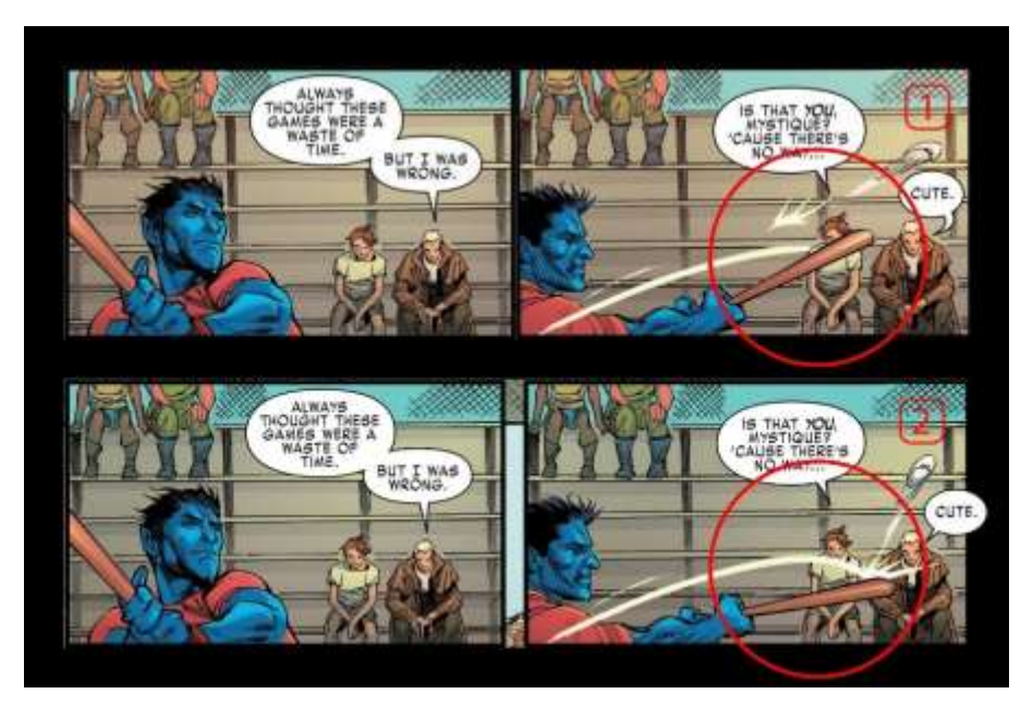
Figure 5 Subliminal Message of Nightcrawler

If compare those two pictures (number 1 and 2), it can be seen that there is a revision on the second panel of the picture [2]. The bat Kurt holds is tilted downward just enough not to give the impression of him hitting Kitty Pryde (Kitty's face can be seen now). The ball's movement is also being revised to make the picture reasonable to that modification.