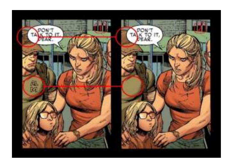
Figure 3 Subliminal Messages of the ALM 51

The next subliminal message appears in a man's outfit; his t-shirt and his cap in Figure 3. He wears a cap with a number 51 (the 1 is not visible) and a t-shirt with three letters, the letters 'A' and 'L' in a row, and a larger 'M' under those letters. The signifier of the picture [1] is that there are four characters visible on the panel. There is a character wearing a cap with number '5' on it. He is also wearing a t-shirt with three letters on it, A-L-M. The signified of the picture is that the number on his cap is actually 51. It means the verse number and the three letters on his t-shirt is an abbreviation of the Surah Al-Maidah. Thus, Syaf wants to show that one of the people that are on the scene is a Muslim. From the gesture, it can be seen that he is not quite happy with the situation.