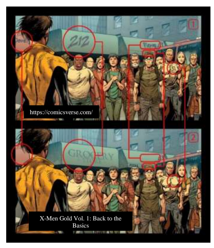
Figure 1 Subliminal Messages Panel Comparison Page 9

Semiology cherishes the implications that a sign can ever give. Any kinds of signs from the alphabet to words, from a single image to a movie, bear the significant messages and meaning behind the existence. Those signs of messages can be really visible to the readers (or viewers), or can also be needed to be examined a little deeper under research in order to reveal the true meaning. There are, of course, a personal intention of the writer (and the artist) to put the message in his/her arts, a phenomenon behind the message(s), and the creativity that determines the placing of the message. The sign then carries a concept and a pattern. In Chandler (2007), Saussure has explained the concept and pattern as a speech act ( parole ) which is created from a system ( langue ). The comics have a similar concept with speech, in which if it puts in the code overlay, it may say that the image is the sign, the material aspect of the image is the signifier, and the mental aspect/the concept that is given by the image is the signified. That image, then, can be considered as a new sign in a new meta-language. Figure 1 contains several subliminal messages in the first issue of the X-Men Gold #1: Back to the Basics, Part 1 , page 9.