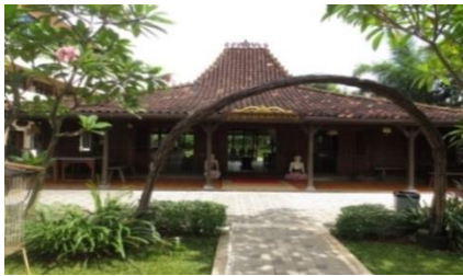
Figure 2 Balance Example in Omah

Omah also uses principle design such as rhythm, where there is some repetition in interior design form, as in wooden wall that comes from some panels with the same size and shape; it can be a knockdown system. For some lower social structure community, the wall that they use to form room interior is made from bamboo, a certain plaited pattern that finally forms a strong and beautiful structure. Javanese building element has rhythm, where the dimension and material are always the same. So does the decoration in some interior, it uses the repeated design. Each of the supporting poles also has the same size and shape. Figure 3 shows the rhythm example in Omah .