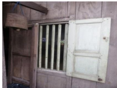
Figure 5 Proportion in Omah

The wealthy of decoration in Javanese house interior is poured in wooden sculptured which has functioned as a decoration or filler in the household utensil. The setting of this decoration considers the proportion that is applied in every room. Organic shape in sculpture motive integrated with the geometric shape in room element is a composition concern in balance, proportion, rhythm, unity, and harmony. From this, it can be seen the unity in Omah interior.