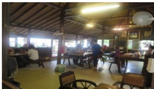
Figure 4 Emphasis in Omah

Javanese house layout recognizes emphasis. The value of holiness, sacredness, and privacy starts from the front side toward backside but does not end in pawon. In fact, they are arranged in such way so that the highest sacred value is in senhong tengah because the central axis is coming from front side and backside that commonly stop at that senhong tengah . Also for the floor height, it has the highest level among others. Cosmologically, Javanese people believe that center point of Omah is the biggest energy that they use it as a shrine for nature ruler power. This emphasis can be seen in Figure 4.