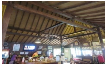
Figure 3 Rhythm Example in Omah

Javanese house layout recognizes emphasis. The value of holiness, sacredness, and privacy starts from the front side toward backside but does not end in pawon. In fact, they are arranged in such way so that the highest sacred value is in senhong tengah because the central axis is coming from front side and backside that commonly stop at that senhong tengah . Also for the floor height, it has the highest level among others. Cosmologically, Javanese people believe that center point of Omah is the biggest energy that they use it as a shrine for nature ruler power. This emphasis can be seen in Figure 4.