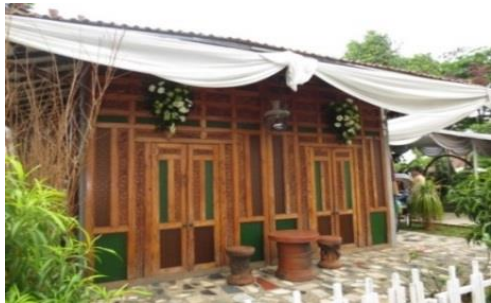
Figure 6 Unity in Omah

Movement applied in the design of Javanese ceiling is construction called tumpang sari . This construction forms a bonding arrangement with the bottom-up order from short to longer part. Tumpang sari consists of arranged blocks as a bond of four main poles in the center of the building. This shape is a strong character that makes Omah different from other traditional house. At this order, it can see the principle of movement, getting bigger toward high level to make a beautiful composition. It can be seen in Figure 7.