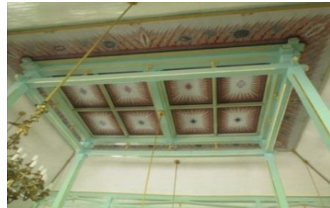
Figure 7 Tumpang Sari as Movement in Omah

The embodiment of Javanese house interior is to be prosperous on earth and in heaven. House refers to the environment, religious surrounding, family circle, and social-cultural sphere. Javanese people realize that they are one of the elements of their environment, so humans unite with their God. A human cannot be separated from nature. That is why, to reach God, the human need to live according to nature, accomplish nature, and keep nature for the prosperousness on earth and in heaven in the corridor of Javanese cultural belief.