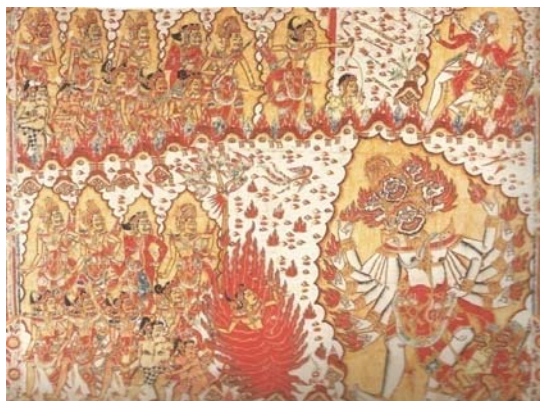
Figure 4 Kamasan, Smaradahana: The Burning of Smara , late 19 th or early 20 th century