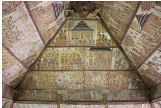
Figure 1 Kamasan Painting at Kerta Ghosa Pavilion Ceiling (Source: Wulandari, 2009)

The research aims to evaluate how western artists and Pita Maha association have influenced the artistic transformation of Balinese painting styles in the 1920s-1930s by comparing Kamasan style painting and works of Pita Maha artists, in particular, those of Lempad's. These particular painting styles are chosen as a representation of each generation in order to clearly show the artistic differences before and after Pita Maha association as well as to show how the younger generation of artists began adopting western style paintings, while still preserving their indigenous artistic value. Figure 1 shows Kamasan painting at Kerta Ghosa Pavilion Ceiling.