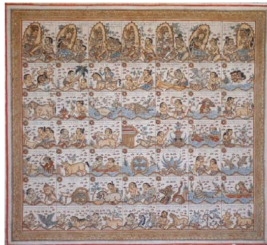
Figure 2 I Nyoman Mandra, Palelintangan , 1997 (Source: The Virtual Museum of Balinese Painting, www.sydney.edu.au , 2016)

view. But evidence show that since 17th century, these wayang paintings are not only located in the wall area but also in flags form ( lontek/umbul-umbul/penjor ), roof decoration ( ider-ider ), wall decoration ( parba ), curtain ( langse ), and as paintings located in the ceilings. Figure 2 shows the depiction of astrological calemders ( Palelintangan ).