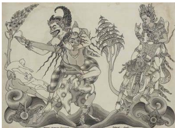
Figure 5 I Gusti Nyoman Lempad, Ramayana Story