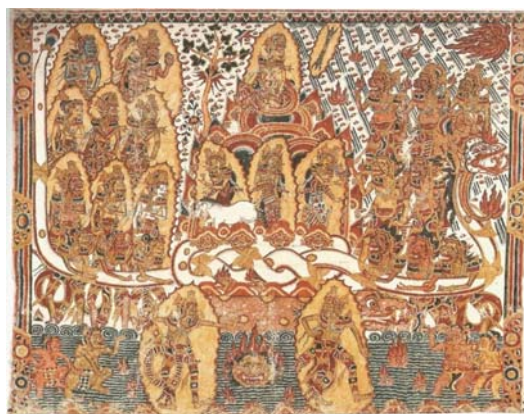
Figure 3 Pan Ngales, Churning of the Ocean of Milk , 1921

The painting also shows how the Balinese depicted details of human figures; their faces are always drawn in three-quarter profile, both eyes being visible. Shoulder and chest face the spectator frontally; legs and feet are once again pictured from the side, one behind the other as if walking. Ramseyers (2002) has pointed out that the figures acting in the paintings are not individuals; they are distinctly contrasted types whose iconographic features enable quick and definite recognition, very much similar to the figures in wayang puppet performances. This can be seen from figures from the left-hand side and right-hand side of the painting. Figures in each group show different iconography; figures on the left-hand side are the noble type figures, elegant in posture, showing different skin colors completed with rays of light surrounding the figures, while on the opposite side are the fearsome and demonic figures. Noble types are characterized by their relaxed yet controlled noblesse with long, thin arms and legs, delicate hands with curved fingers, narrow, straight nose, and smiling mouths lend them grace. The colors of noble characters are white, pinkish-beige and light ocre, or they are determined by the color of the particular god incarnated in the figure. Thus Rama and Krishna as Vishnu incarnations appear in green or blue, such as the figure on the top left-hand side of the painting. The case is completely different for crude characters and demonic types on the right-hand