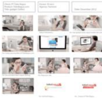
Figure 5 TokoBagus Tactical Television Commercial Gadget at the end 2012

The objective of the campaign was still the same like the previous one. The objective was to persuade more people to become a seller at TokoBagus. Based on the research, many people felt that they did not have any goods for sale. TokoBagus gave the inspirations that everyone could be a seller. Certainly, everyone had some unused goods in the house, and it can be sold. Besides that, the proposition was an alternative source to make some money by selling your unused goods. It emphasized on utilizing the unused goods. The tones of voices, mandatories and media were still the same like the previous campaign. The desired response was utilizing the unused goods to make some money by selling them at TokoBagus. This time, the versions were the couple, men, and women. Besides that, the creative strategy was the exaggeration. The storyline for the couple version was a couple bought a crib, but because of there were too many unused stuff in their house, there is no place to put the crib. TokoBagus had a perfect solution for them; sold the unused stuff.