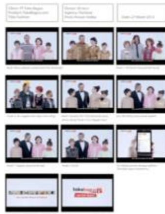
Figure 4 TokoBagus Tactical Television Commercial about Fashion in Early 2012

looked for what they wanted in TokoBagus. The mandatory were still the same. The tones of voices were still the same as the previous campaign, but the setting used was a white background to emphasize the diversity of the products/services sold in TokoBagus. Seven series were featuring the different categories of products/services; they are camping equipment, fashion, property, automotive, furniture, services, and fashion accessories. The creative strategy was the demonstration, where it showed many kinds of products/services sold. The creative approach was the exaggeration. All of the series had similarities in the cinematography, the plot, and the voice over/narration. Each of the series had two versions of duration, 15 seconds and 30 seconds. Both of the versions had the same message but only shortened. The storyline for the fashion version of Figure 4 was showing a family that each member had a different preference of fashion style. They argued in choosing a costume for a family photo. Each of their fashion preferences could be found at TokoBagus.