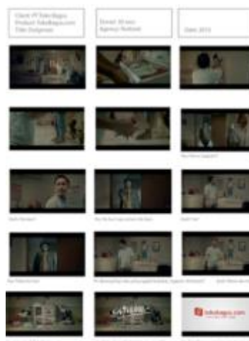
Figure 8 TokoBagus Television Commercial Outgrown at the End of 2013

Overall, this campaign was similar to the previous campaign in early 2013. TokoBagus only renewed the creative execution, so the advertisement felt fresh. Three versions categorized based on the target market; couple, men, women. The storyline for couple version in Figure 8 was a father helped his son changing clothes. The mother that had just come home from shopping was shocked because her son wore his old baby clothes. It turned out that the father took the wrong clothes because the mother still kept the unused clothes in the drawer. TokoBagus gave them an idea to sell the unused clothes through its site.