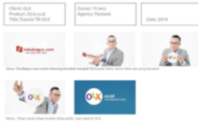
Figure 10 the Name Changing Announcement Television Commercial 2014

OLX.co.id launched television commercials/ Youtube video that looked exactly like the TokoBagus television commercial, but the brand name had already changed into OLX.co.id. This version can be seen in Figure 11.