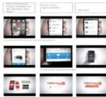
Figure 7 TokoBagus Mobile Application Commercial

In the middle of 2013, TokoBagus launched a mobile application. To inform that, TokoBagus issued a new tactical television commercial. The proposition was TokoBagus mobile application facilitates an easier way to buy and sell goods. The mandatory were middle range smartphones as a representation that the application is compatible with any smartphones, how to use the application, and logo. The tone of voices was direct and simple because this advertisement was launched while the other TokoBagus advertisement was still running. Therefore, the new message was conveyed as simple and clear as possible to avoid the confusion. The desired response was people download and use the application. The creative strategy was a demonstration. The setting was only a white background so the message can be delivered more focused and clear. There were four versions: 1 version for the buyer, three versions for the seller. It can be seen in Figure 7.