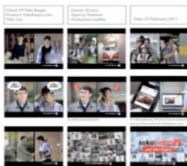
Figure 2 TokoBagus the Tactical Television Commercial Automotive Version

While, the tactical television commercial automotive version can be seen at Figure 2 told a story about a comparison between two situations shown in the split window. The left window showed a family rode a motorcycle. Because of the number of the family member, they needed a car. The right window showed a person rode a car but he is more comfortable to ride a motorcycle. Because of TokoBagus, both of them met and made the trade transaction. The family bought the car, and the person bought the motorcycle. The creative approach is the comparison, which compared two situations that could form a mutualism symbiotic.