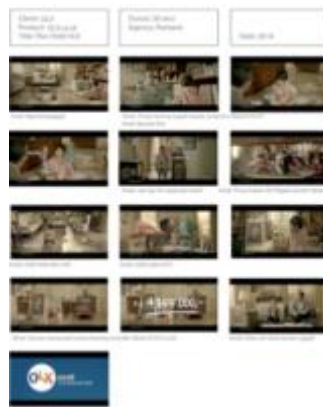
Figure 11 the First OXL Television Commercial 2014

OLX.co.id launched television commercials/ Youtube video that looked exactly like the TokoBagus television commercial, but the brand name had already changed into OLX.co.id. This version can be seen in Figure 11.