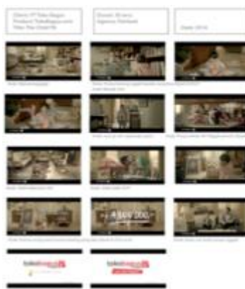
Figure 9 The Last TokoBagus Television Commercial 2014