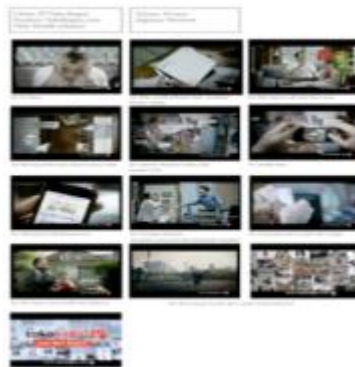
Figure 3 TokoBagus Eid Television Commercial 2011 (Source: Pantarei Communication)

The proposition was the alternative source to make some money. This strategy is fit for Eid season because there is an urgency to get some money to celebrate lebaran together with the family in the hometown. In order to build a consistent brand character, the tones of voices were still the same as the campaign before. The media also had not changed. The desired response was people got an idea to make fast additional money by selling goods in TokoBagus. The creative strategy was giving advice, where this advertisement gave an advice on how to make alternative money. The video in Figure 3 showed Agus had a difficulty to come to his hometown. Agus was advised to sell his unused things in his warehouse at TokoBagus. Because of that, Agus got some money to celebrate lebaran at his hometown.