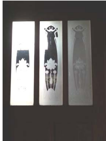
Figure 9 Art Nouveau motifs, Sandblasted glass elevator door, Niagara Hotel