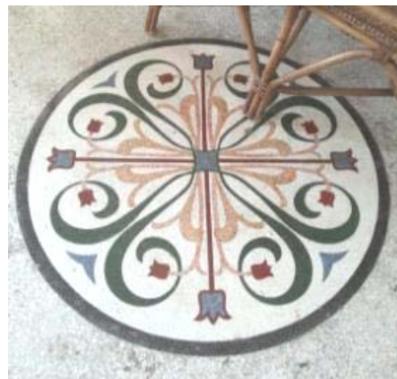
Figure 11 Art Nouveau motifs, floor pattern Niagara Hotel