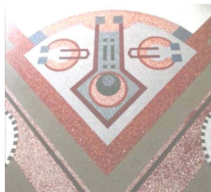
Figure 13 Art Deco motifs, floor pattern Niagara Hotel