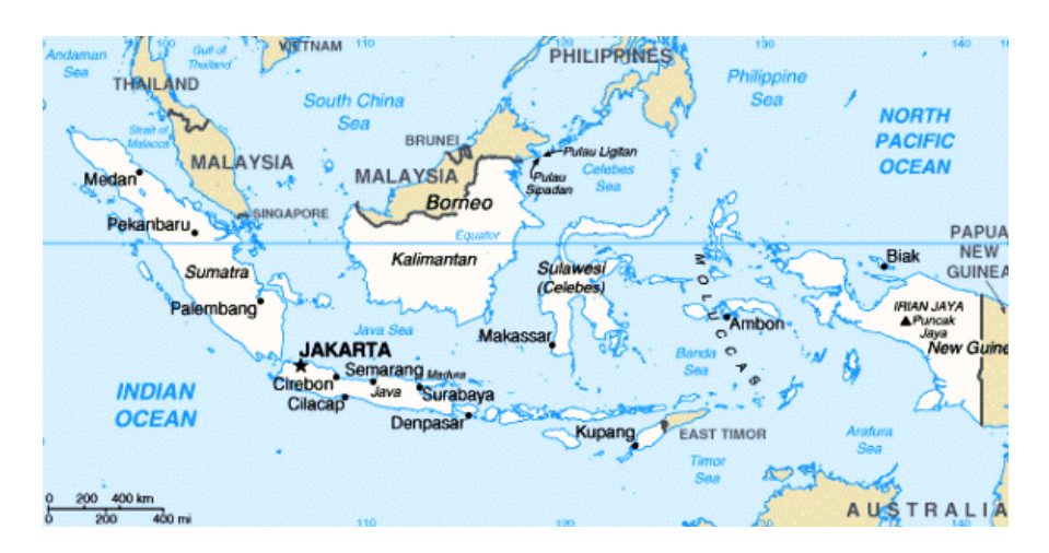
Figure 1 The map of Indonesia & Malaysia . Web accessed 8 January 2012 (waronterrornews.com/indonesia_malaysia.html)

Indonesia and Malaysia are two neighboring countries, geographically located in Southeast Asia. As we can see in the map below, this region consists of many islands, big and small. In fact there are thousands of islands in total, and together they are called Nusantara . History tells that the word Nusantara was said back then in the year 1336, in an oath by Gajahmada , a military leader of Majapahit Empire . In his oath he determined to conquer the whole archipelago under the authority Majapahit . When the colonialism took a power in this region, the archipelago is divided into a few smaller regions, which is then grow into a different nations named Indonesia, Malaysia, Singapore, Brunei and the Philippines.