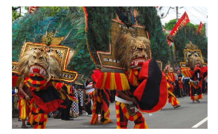
Figure 2 Reog Ponorogo performance

Reog Ponorogo is a dance performance, which demonstrates physical strength and extravagant lion-peafowl mask and costumes. While Reog dance itself originally comes from Java island in Indonesia, this dance also spread in Malaysia, namely in Johor region. The reason is because there are numerous descendants of Javanese immigrants; whose brought Javanese culture along with their migration (Prathivi 2009). In their new homeland, with the collective memory on works, they continue to practice the arts, and even consider it as their occupation. A simple gesture that did not hurt anyone.