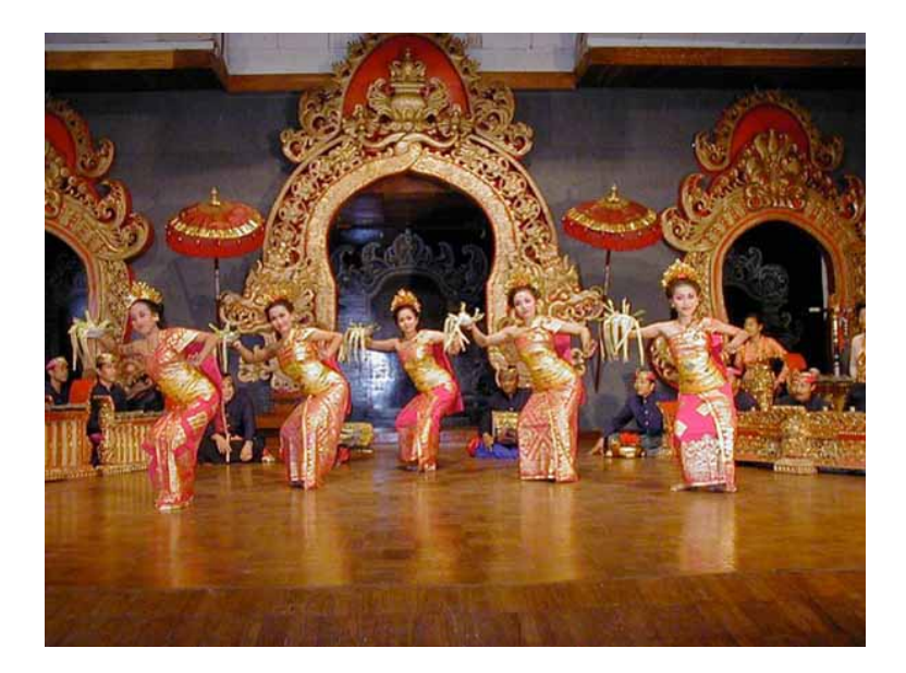
Figure 3 Pendet Dance . Web accessed 5 January 2012 (the-indonesian-cultures.blogspot.com/2010/09/tari-pendet-pendet-dance.html)

In 2009, Discovery TV network launched a commercial in Singapore with the title Enigmatic Malaysia , featured Pendet dance , which was mistakenly seen as Malaysian dance. As expected, this commercial angered millions of Indonesian. Having realised this unexpected outcome, Malaysian government then apologised. But the Indonesian counterpart was quickly rejecting this apology, because it was done only via telephone, which was considered to be informal. Indonesian Tourism Minister demand an official letter of apology, but this demand is declined by the Malaysian, since they did not feel responsible for a commercial that was not an official product of Malaysia (Sagita 2009). Later the television network who produced the commercial removed the advertisement and delivered a formal apologies to both nations, but the damage has been done (Karana, Prameshwari 2009).