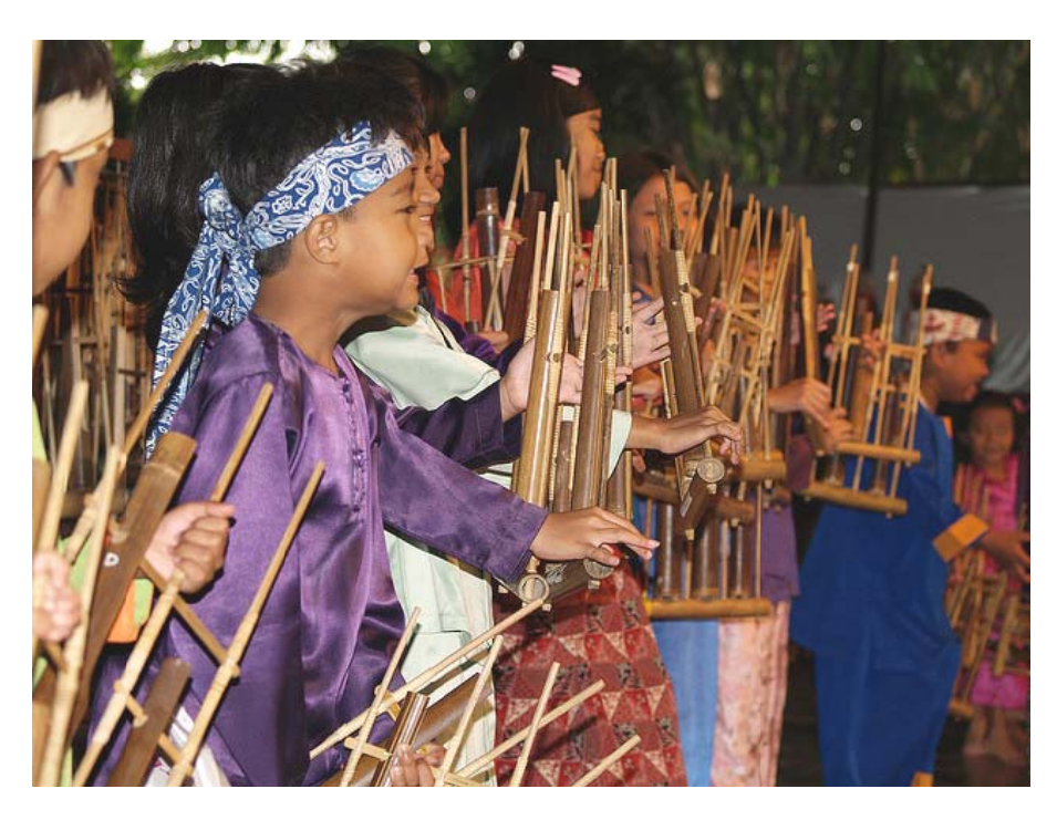
Figure 5 Angklung . Web accessed 5 January 2012 (traditionalmusicinstrument.blogspot.com/2011/07/how-to-to-playing-angklung-part-1.html)

Later on Indonesian government then registered the instrument and in the year 2010 UNESCO listed angklung as Indonesian intangible cultural heritage (UNESCO 2010).