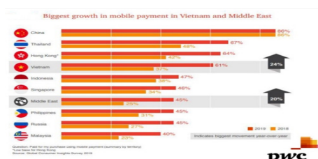
Figure 1. Mobile Payment Growth in Several Countries

Indonesia ranked 5th among the countries with the largest mobile payment service development (Davis, F. 2019) as seen in figure 1. However, its financial literacy index is only 32% (Klapper, et al. 2015) and ranks 85th of 144 countries. In addition, 4 out of 5 Indonesian gadget users use their smartphones to buy some goods online and 54% respondents are tempted because of the coupon and discount offers (GlobalWebIndex, 2019).