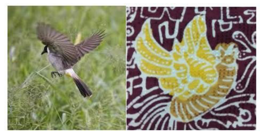
Figure 2 Motif Burung Cangkurileung