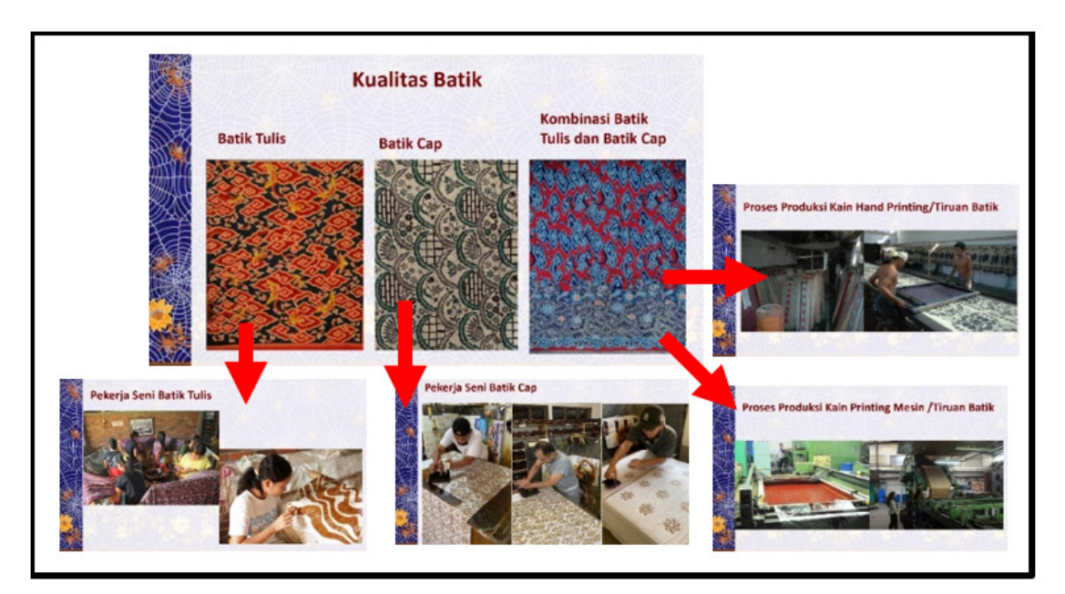
Figure 5 Faktor proses produksi Batik (Kudiya Komarrudin)

Here are some simple explanations with pictures to provide an understanding of the case study from Batik Komar. Factor 1 discusses how the batik industry in Indonesia is based on several points, namely humans, nature and the dyes used. The purpose of all this is to produce the quality of the batik to be achieved.