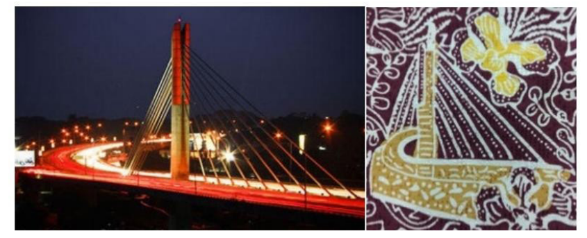
Figure 1 Motif Jembatan Pasopati

In figure 1, the Komar batik motif of the Pasopati bridge is displayed which is a landmark of the city of Bandung. The image of this bridge icon was selected into the batik drawing to give a modern impression to the depiction of Komar batik. Furthermore, figure 2 shows the Cangkurileung bird which is a fauna characteristic of the Bandung city which is also used as Komar's batik motif. Finally, the picture in figure 3, namely the Sundanese script used in Komar batik, which is often seen on road markers in every corner of the city of Bandung.