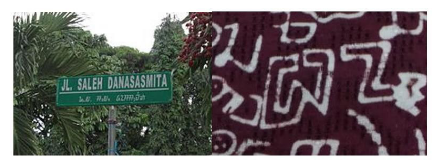
Figure 3 Motif Aksara Sunda (Source Sylvia et al, 2019)

In Komarrudin's view, there are several stages of creative design that are taken to produce new batik decorations. The first is the process of exploring, discovering and formulating the visual and non-visual elements of the identity of a region. This is necessary to recognize the philosophical, historical, and even the identity of the local culture that you want to represent in batik later. Second processes design and reproduce correctly these products from the data that has been obtained. Third, reflecting a new batik decoration in the form of a variety that has been processed in the composition of shapes, colors to suit the tastes of the wider community - even accepted by the global community (Kudiya, Sabana, & Sachari, 2014). The following in figure 4 is an illustration of the production process scheme of batik komar: