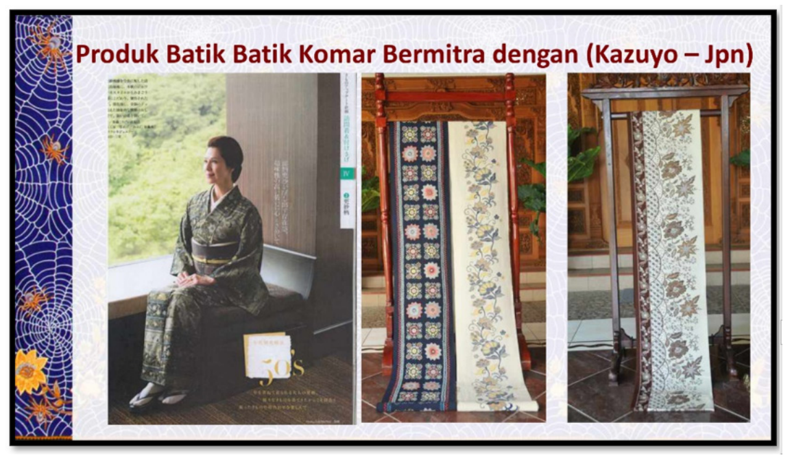
Figure 7 Batik Komar - Kazuyo in Japanese fashion (Kudiya Komarrudin)

In the two samples above, it can be understood that batik itself will eventually experience acculturation with existing global cultures (America and Japan). However, it is the value and meaning of the batik pattern that characterizes Indonesia. This is what makes batik a representation of Indonesian cultural identity.