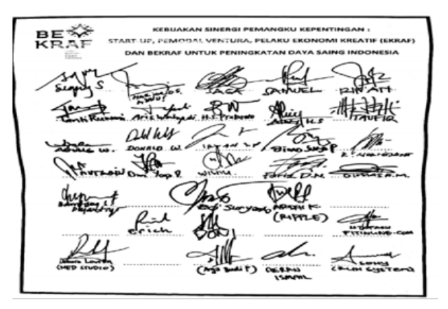
Figure 3 Sigantures of a Commitment to Stakeholder Synergy Policy and BEKRAF to Improve Indonesia's Competitiveness

Capital access activity from the supply side is expected to make capital owners: Commit to being willing to become a mentor and invest their capital in the startup. The owners of capital include venture capital companies, banking, financial technology, philanthropic associations, angel investors, CSR, LPDB, PBMT Ventura.