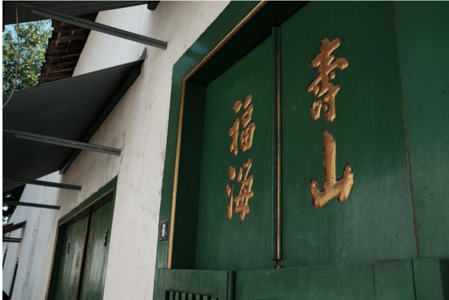
Picture 2. Chinese heritage around Lasem

The Cu An Kiong Temple was founded around the 15th century, in the Lasem area, Central Java, with the official address of Jalan Dasun No. 19. Nobody knows exactly when this temple stood because at that time, most of the Chinese people around the location had not been able to read and write, and caused no data on the establishment of temples. However, the Cu An Kiong temple was estimated to stand around the 1470s, because when the Dutch made the Lasem map in 1477, the temple was already included in it.