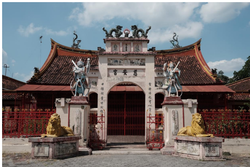
Picture 3. Front façade of Cu An Kiong Temple

Cu An Kiong is believed to be one of the first temples on Java built by Chinese who landed in Indonesia. This temple was established as a place to worship the Makco (goddess) Tian Siang Sing Bo or the Goddess of the Ocean which has provided safety on a voyage from China to Java. It is said that the Lasem area was also first opened by people from China to live and trade, and gradually became the area with the most Chinese population on Java, making it earned the nickname “Little China” until now (National Geographic, 2015). Local residents also began to bustle in Lasem until finally the Dutch VOC (Vereenigde Oostindische Compagnie) came to Indonesia.