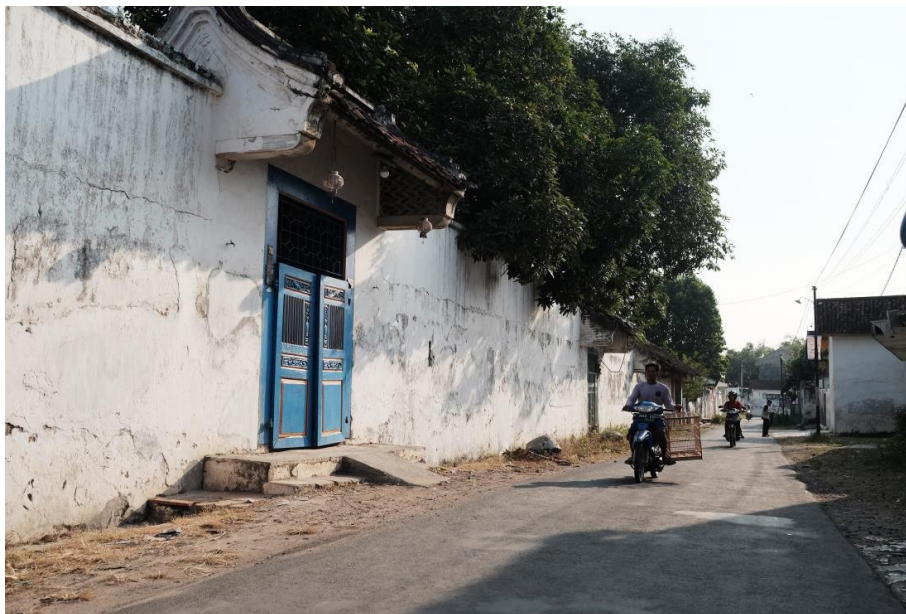
Picture 2. Streets around Cu An Kiong temple

Before entering into the discussion of temples, we must first see the ancient Chinese buildings in Lasem. Houses of Chinese descendants in Lasem can be categorized as a peranakan version. It is called peranakan because in China the form of the house itself has a number of differences from the form of Chinese housing in Lasem. The ancient Chinese buildings and housing in Lasem have large, large-sized land and high walls, are equipped with various Chinese ornaments and have an offering place for ancestors/ gods.