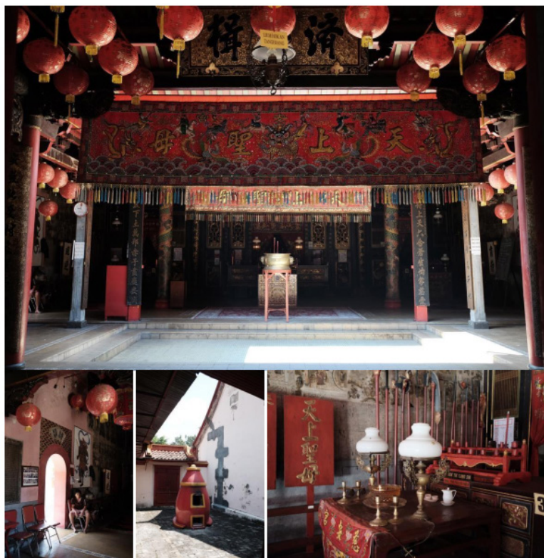
Picture 5. Clockwise from top : Image 1. Center of temple, 2. Altar, 3. Stove for burning paper, 4. Gate

In the opinion of Marcel Danesi and Paul Perron in chapter two, that the observer’s emotional response to the architecture of a building is influenced by the material used, the arrangement of architectural elements, and the lighting condition inside the architecture. So from the shape of the building which resembles the architectural building in the State of China, the Chinese people in Lasem give the meaning that this building is very close to their ancestors who came directly from China. They deliberately built this building to have emotional connection with their ancestors.