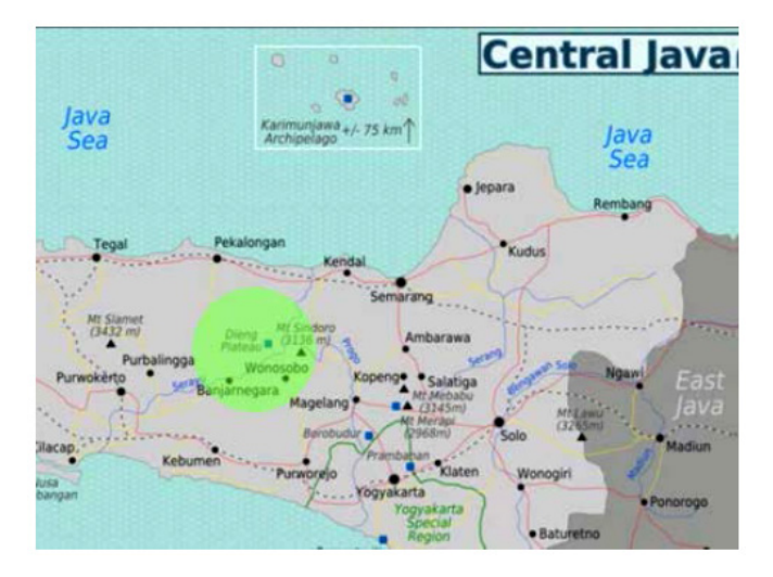
Figure 1 Location of Dieng Culture Festival (DCF)

DCF is pioneered by a tourism awareness group (POKDARWIS) of Dieng Kulon, Batur, Banjarnegara, Central Java. This cultural event is an activity to preserve the culture and tradition and to promote the potentials of natural and cultural tourism in Dieng, Central Java. Geographically, Dieng is located in the area of Wonosobo. The location is in Figure 1.