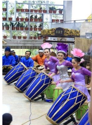
Figure 8 The traditional dancing of Sunda Culture: Rampak Gendang