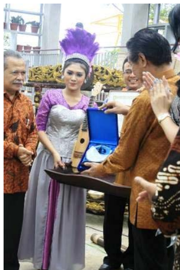
Figure 4 Tribute to Sentul City Management as the Host of Anugerah Bambu Indonesia, 2013