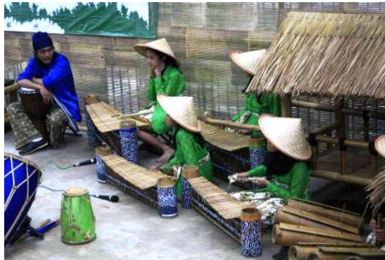
Figure 6 The Bamboo Music Orchestra in Anugerah Bambu Indonesia, 2013