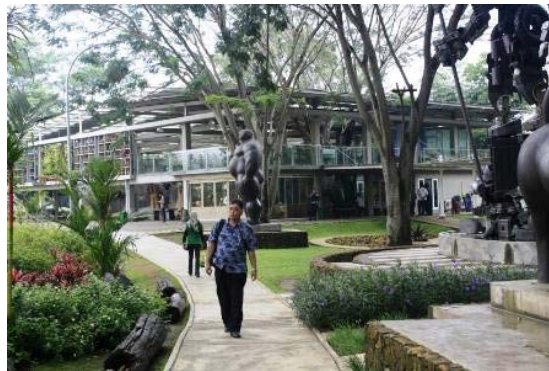
Figure 3 Eco Art Park, Green House, Sentul City, Bogor as the Venue of Anugerah Bambu Indonesia 2013