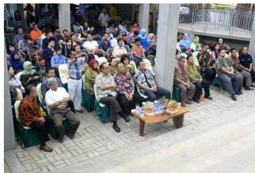
Figure 9 The Audience of Anugerah Bambu Indonesia, 2013

According to the below photos, they show the mix visitors who attend the event – community, governmental associates, education decision makers, students and so on.