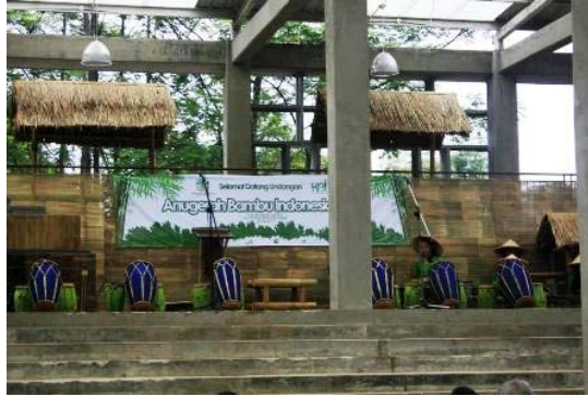
Figure 5 Natural Decoration of Anugerah Bambu Indonesia, 2013