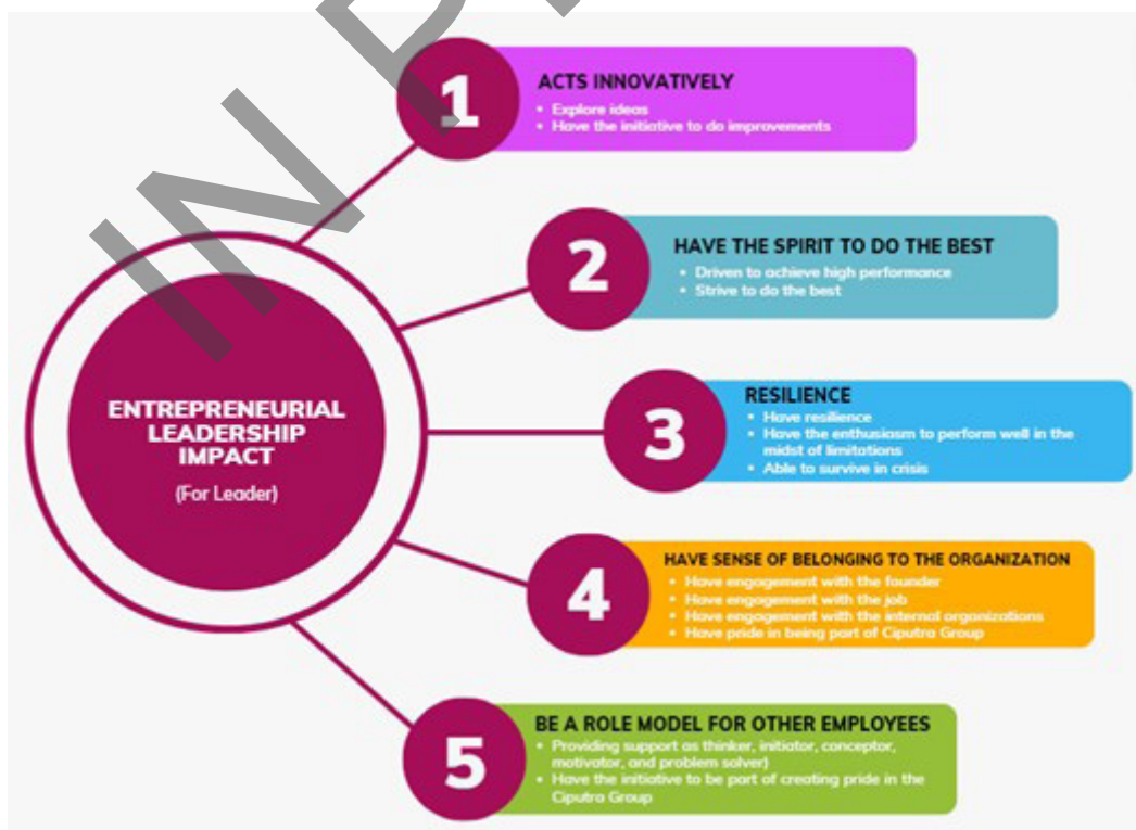
Figure 4 Entrepreneurial Leadership Impact