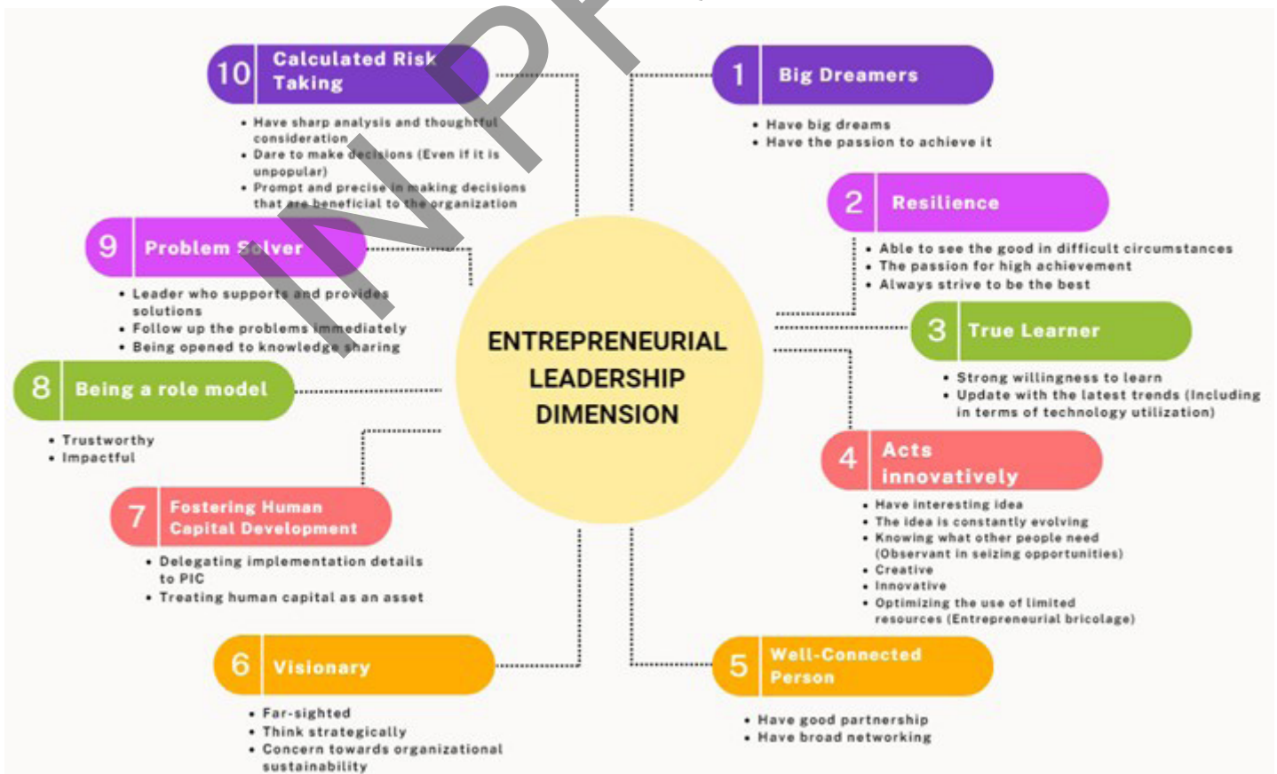
Figure 3 Entrepreneurial Leadership Dimensions by Ciputra

The second dimension of entrepreneurial leadership that belongs to Ciputra is resilience. Ciputra is a leader with strong willpower, which is evident from his enthusiasm and efforts to always strive for excellence. He consistently encourages leaders to see the positive aspects of every difficult situation they