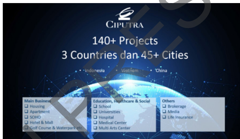
Figure 1 Profile of Ciputra Group

The research employs a qualitative approach using the Simple Research Design (SRD) model. According to Bungin (2024), the SRD model involves seven main steps in research as seen in Figure 2. The initial stage of the research starts with the social context and phenomenon. It utilizes Methods of Scientific Thinking (MST), which involves exploring research problems through discussions with leaders who interact directly with the founder (Bungin, 2024). This step is carried out to explore which phenomena can be elevated to research topics. In addition to discussions, observation, and in-depth analysis are conducted through documentary exploration related to the dimensions of entrepreneurial leadership associated with Ciputra.