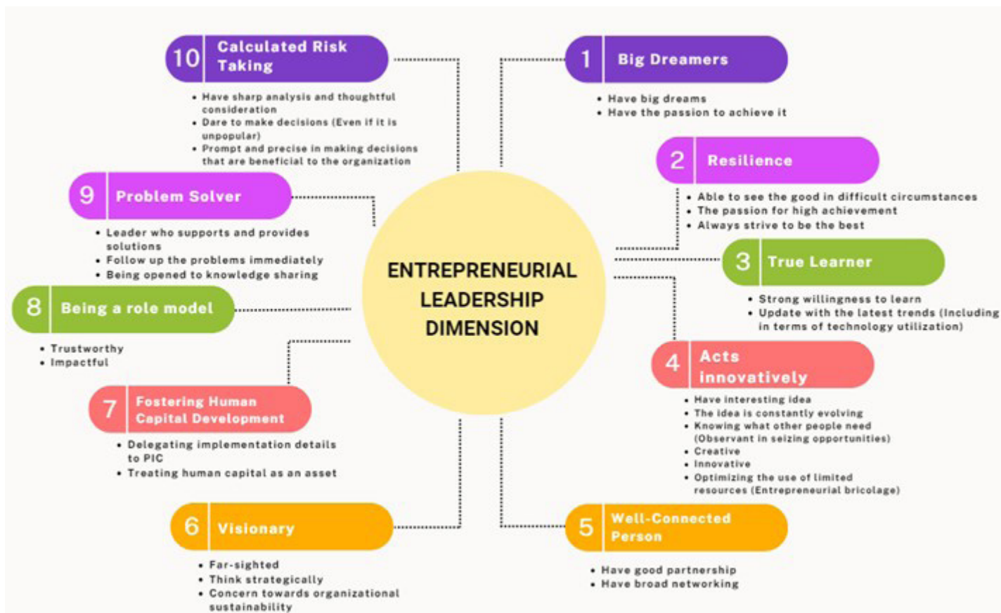
Figure 3 Entrepreneurial Leadership Dimensions by Ciputra