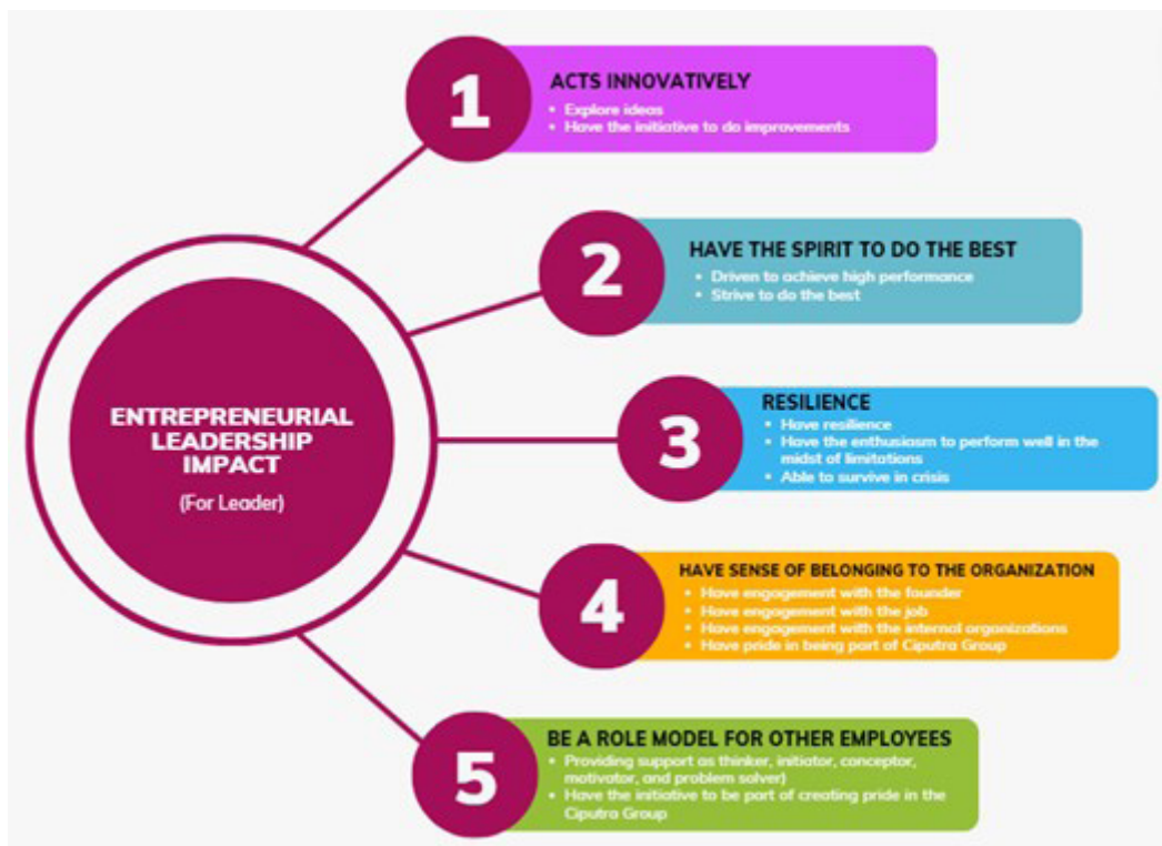
Figure 4 Entrepreneurial Leadership Impact

The tenth dimension of entrepreneurial leadership that belongs to Ciputra is calculated risk-taking. Ciputra is known for his courage when taking risks. A leader's willingness to take risks is crucial to business development (Postigo et al., 2021). Calculated risk-taking is defined as a leader's bravery in taking risks carefully considering organizational activities (Widyani et al., 2020). Not only is he swift in decision-making, but he also possesses sharp analysis and thoughtful consideration, ensuring that his decisions benefit the organization. This is reflected