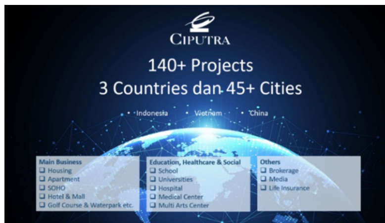
Figure 1 Profile of Ciputra Group

The research employs a qualitative approach using the Simple Research Design (SRD) model. According to Bungin (2024), the SRD model involves seven main steps in research as seen in Figure 2. The SRD model is flexible, following the post-positivist/naturalistic paradigm, allowing the data analysis process to be used freely according to field needs. When the research begins, the design is entirely quantitative, with the positivist aspect evident in the use of theory and a deductive way of thinking. However, when analyzing the data, the research design shifts to qualitative, adopting an inductive way of thinking (Bungin, 2024).